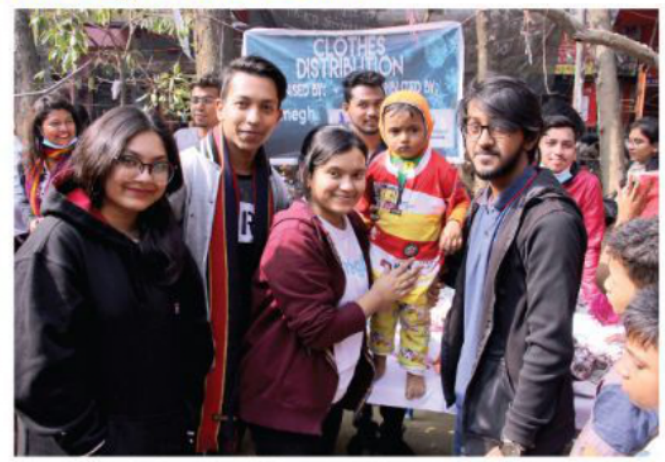
Winter clothes distribution by Daffodil International University.

Daffodil International University (DIU) distributed winter clothes to 10 thousand people as ASR (Academic Social Responsibilities) on 10th and 11th January 2019 in differentareas of Dinajpur, Panchagarhand Kamrangirchar in Dhaka. A total number of 35 volunteers of Daffodil Institute of Social Science (DISS), Change Together Club and DSA participated in the overall program which was coordinated by Nirmegh Foundation.