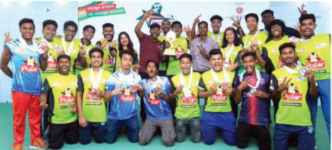
DIU won Fair Play Award in Bangabandhu Inter University Sports Champ 2019

Daffodil International University (DIU) has won the 'Fair Play Award' including 4 Gold Medals, 6 Silver Medals and 4 Bronze Medals in the prestigious tournament of Bangabandhu Inter University Sports Champ 2019. Daffodil International University achieved 4th position among 65 public and private universities in Bangladesh in Bangabandhu Inter University Sports Champ 2019. The final round and medal giving ceremony was held on 27 April 2019 at Bangabandhu National Stadium where HE Sheikh Hasina, Honorable Prime Minister was present as the Chief Guest.