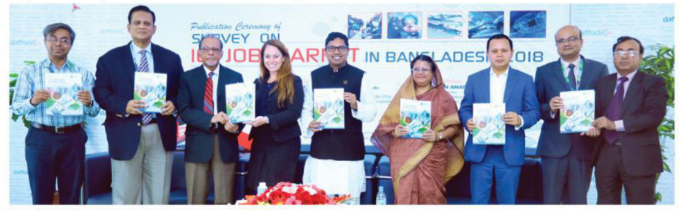
Mr. Zunaid Ahmed Palak, Honorable State Minister unveiling the survey report

The report will be a useful document for the employers, employees, policy makers, entrepreneurs and also other stakeholders, to obtain comprehensive analysis, based on updated information of ICT Job Market in Bangladesh.