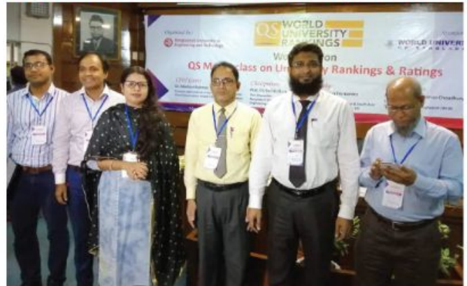
Distinguished participants and guests from DIU and others at the workshop.