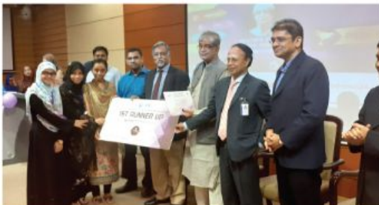
Mr. Mustafa Jabbar, Honorable Minister handing over the 1st Runner Up Trophy to the students of DIU