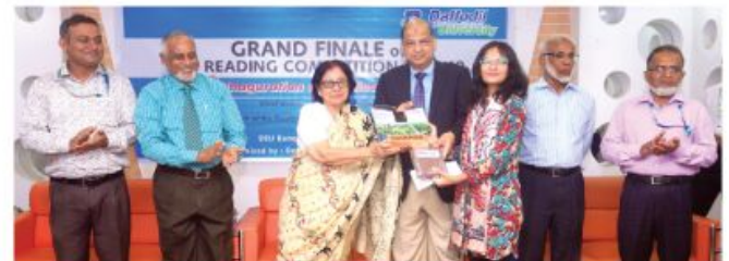
Country's renowned writer of Bangla Literature Ms. Anwara Syed Haq handing over the Championship Award