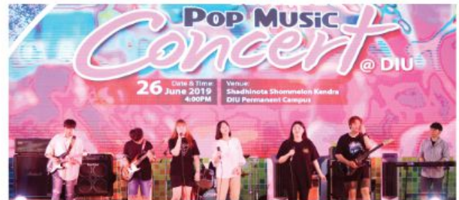
Faculty members and students of Music Department of Hanseo University performing at the Korean Pop Music Concert at DIU

With a view to sharing cross-cultural experience, a delegation of 28 members from Hanseo University, South Korea visited Daffodil International University (DIU) Bangladesh on 26 June 2019 for Korean Pop Music Concert at the Permanent Campus of DIU in Ashulia, Dhaka. Around 3000 students from different departments & campuses took part to enjoy the Korean Pop Music performed by the Music Department students & Professors of Hanseo University. An exclusive performance was also presented by the Cabin Crew Department students. At the concert, the team performed not only Korean pop songs but also some famous Bengali and English songs. Everyone was surprised to listen to the Bengali songs at the concert by Korean performers.