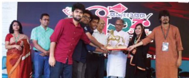
Country's Renowned Artist Mustafa Monowar and Novelist Imdadul Haq Milan handing over the Champions Trophy