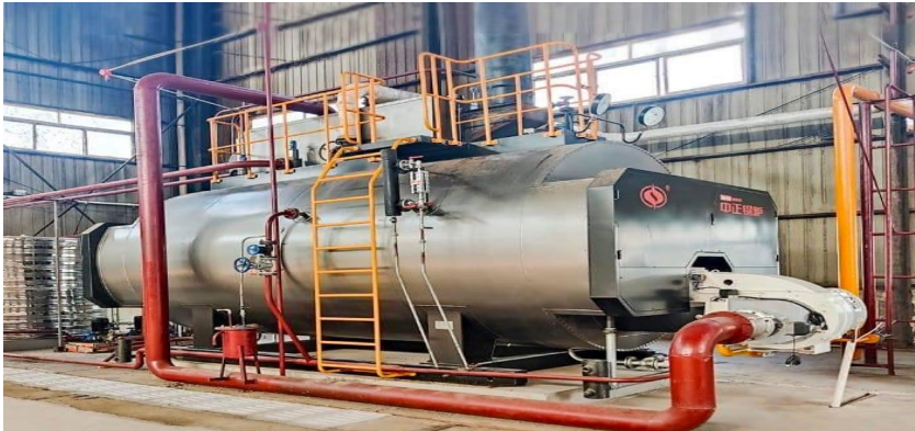
2: Boiler dual fuel