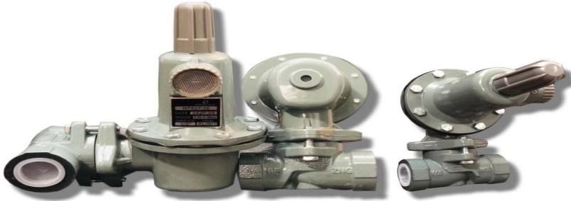
1: 627 Model high-pressure Regulator (Lpg/ng)