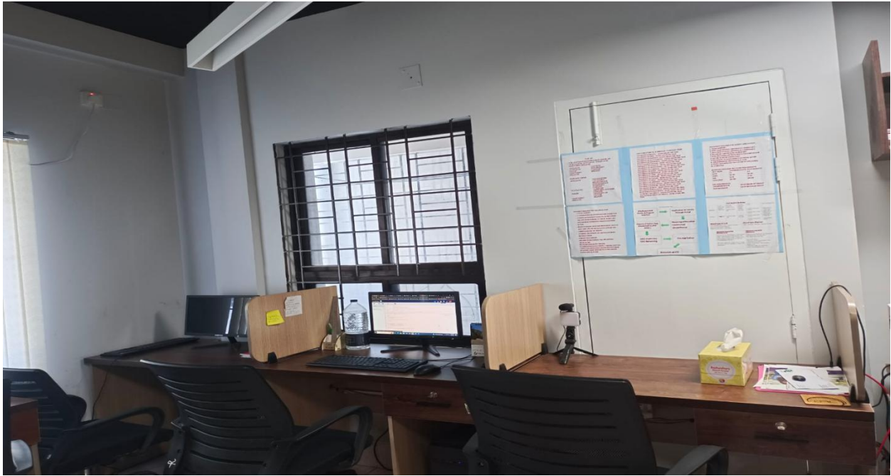
Picture: Backend operations room