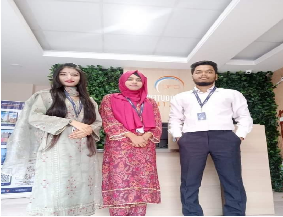
Picture: Colleagues of my office.