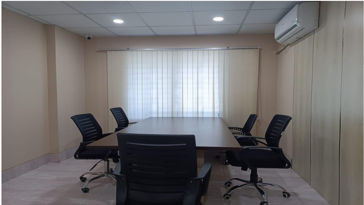
Picture : Conference room