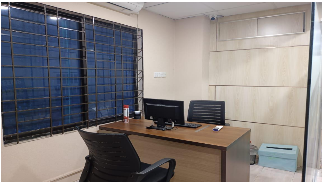
Picture: Supervisor's room