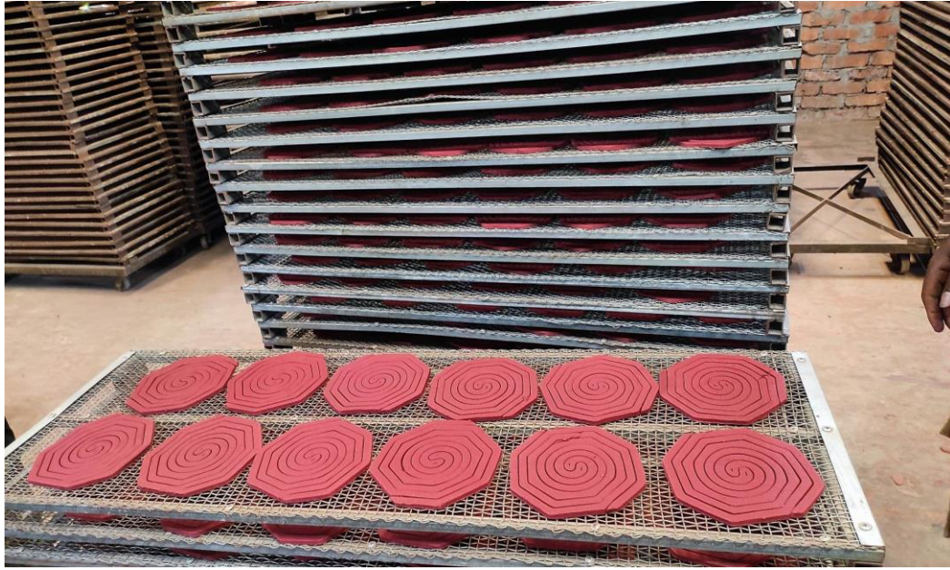
Some pictures of production time