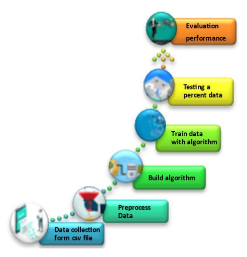
Figure 1. Procedure of satisfaction on online education using machine in COVID-19 situation

All researchers get below ninety percent of accuracy but in our research, we get up to ninety percent score. In our research to classify the student's satisfaction rate, we have to use linear regression, k-NN, support vector machine (SVM), and naive Bayes classifiers. Here use sixteen variables to classify the satisfaction rate. But we have prioritized some variables to classify. In this study, we get 799 data from students and around 160 pieces of data used to check to predict our classification. This research use tow set of data one is the tanning data set and other is the testing data set. Pre-process the data and fit in algorithm and finally evaluate the performance table; Figure 1 represents the model of procedure in our work.