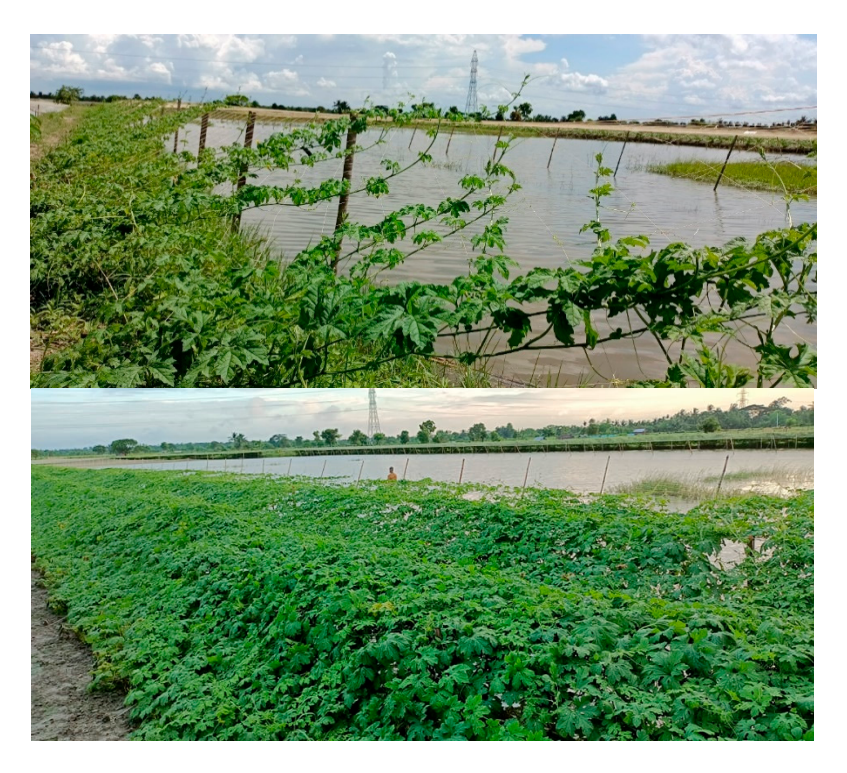
Figure 2. Integrated rice–prawn–vegetable farming system in wet season showing the vegetables on the embankment.

indicates the period up until the planting of rice and vegetables, and stocking of prawn, shrimp, and carp; indicates starting of harvesting period.