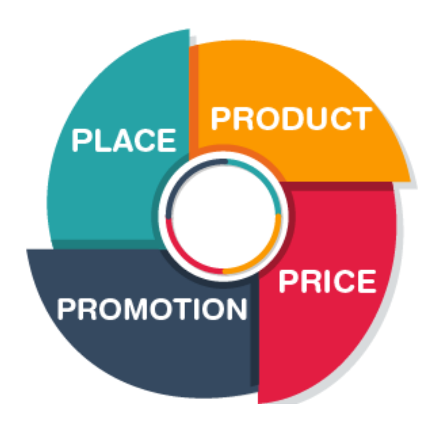
Figure : Marketing Strategy