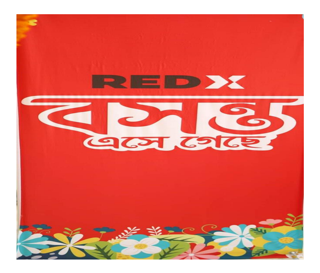
Figure 2.5. c : Falgun Banner of Redx

C. Cultural Activity : The company arranges some cultural programs and all the employees to participate in the program such as Bangla New year celebration, Falgun celebration etc.