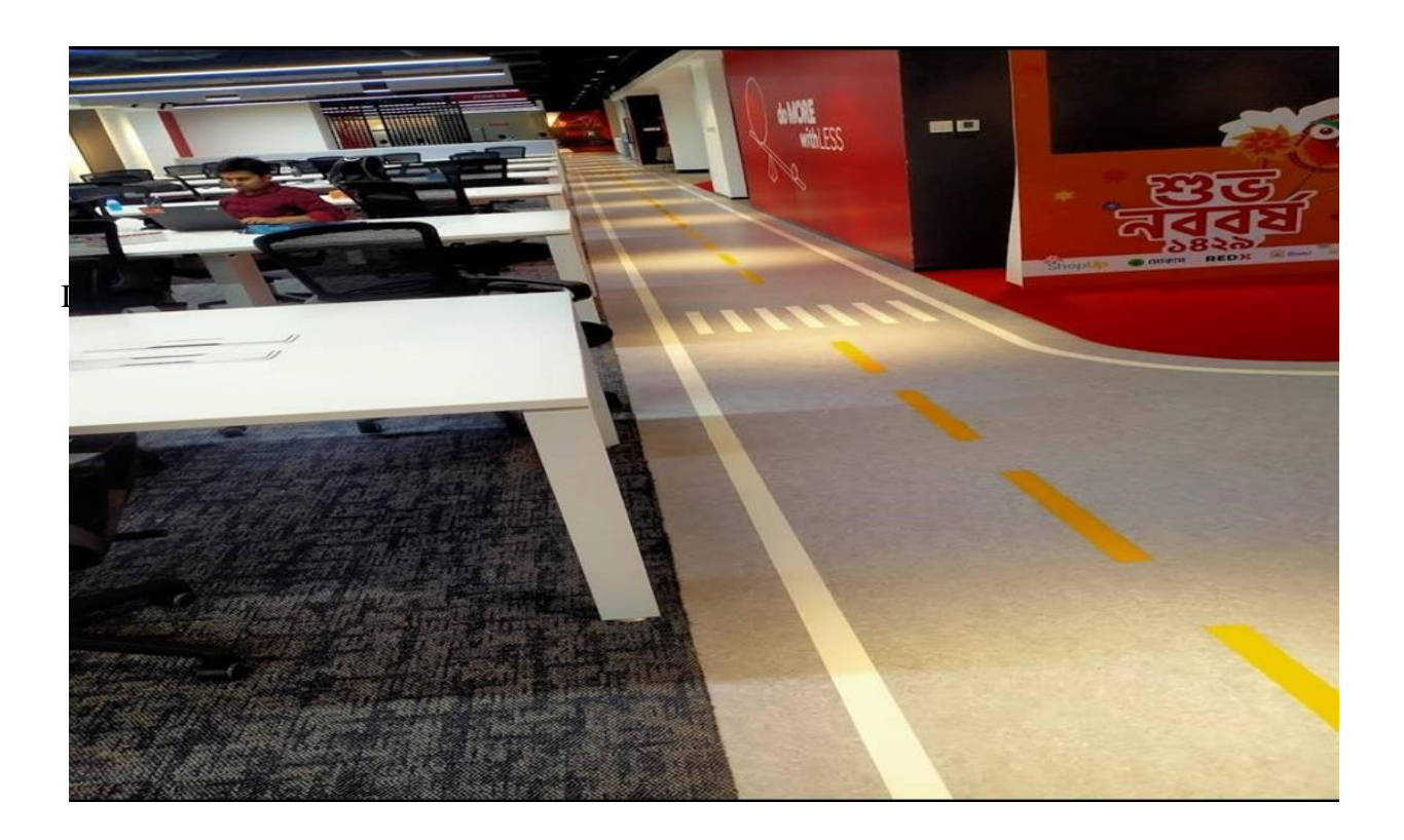
Figure 2.1: Front Overview of Redx Head office

Redx Logistics Limited is the logistics company in Bangladesh that is expanding the quickest. Redx Logistics Ltd, which first catered to small business owners, today provides services to the bulk of Bangladesh's well-known companies.