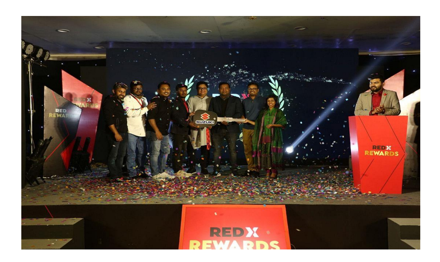
Figure 2.5. b : Redx rewards its top-performing employees