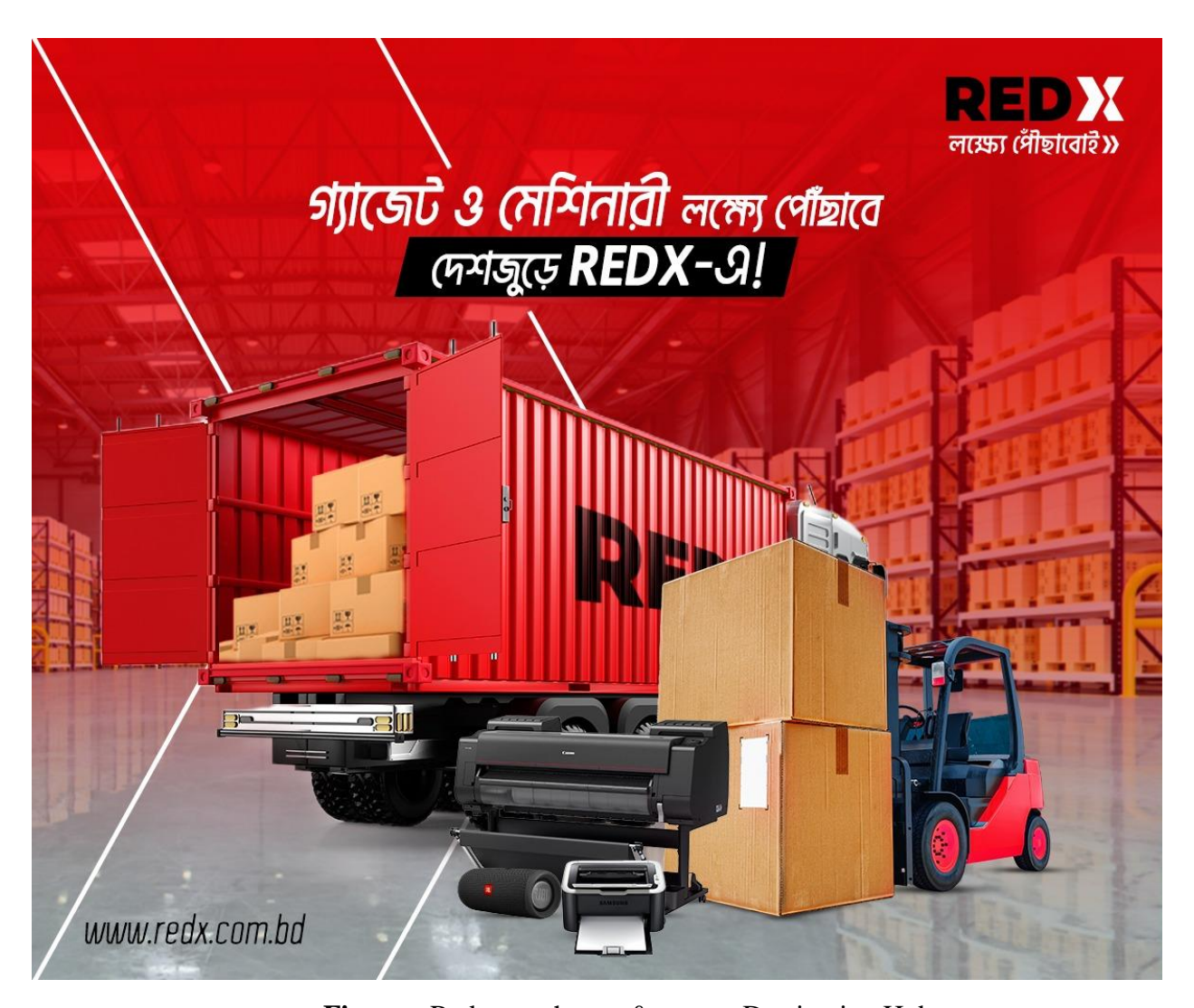
Figure: Redx warehouse & sent to Destination Hub

c. Distribution Center for the Specified Area: The package was purchased at the warehouse and delivered to the destination hub location.