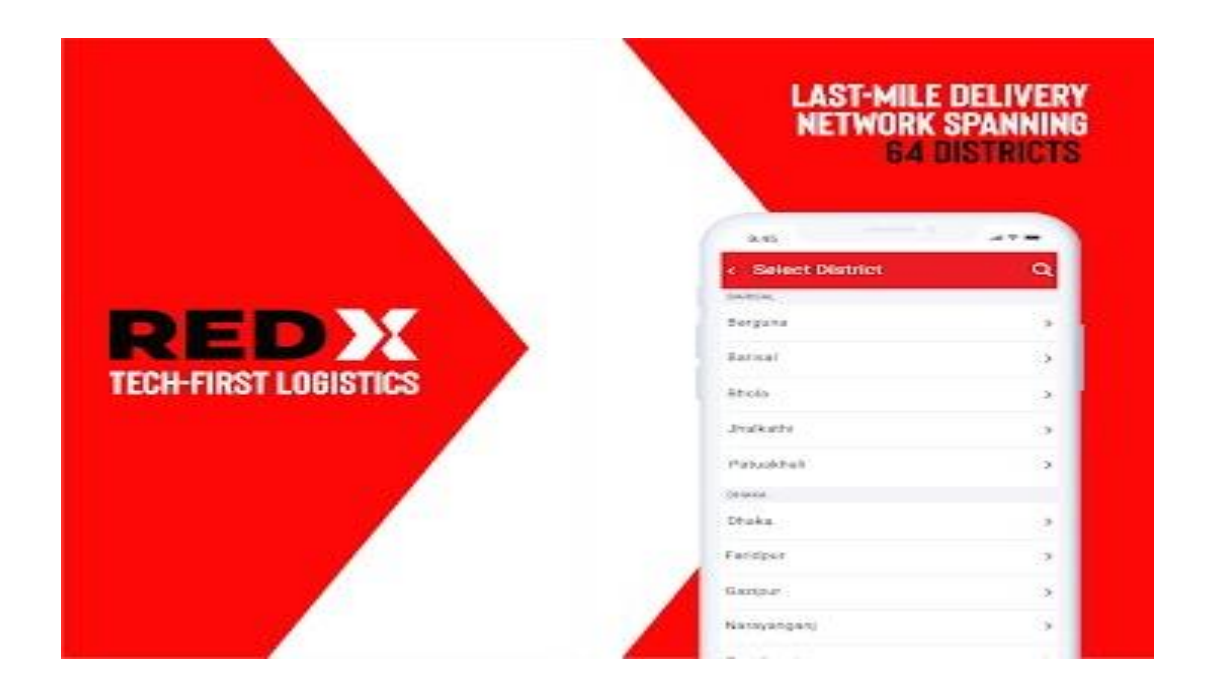
Figure: Redx Delivery Apps of Redx Logistics Limited

a. Pickup Order at Retailer: Redx is introducing applications for Retailer. Apps are used by the merchant to build their account. Via apps, the merchant sent a request for pick-up of his or her package. next the merchant enters the customer's name, address, phone number, and COD amount.