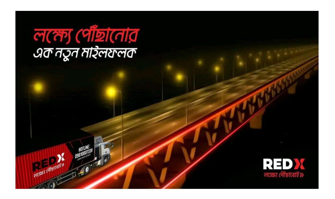
Figure: Redx Cargo