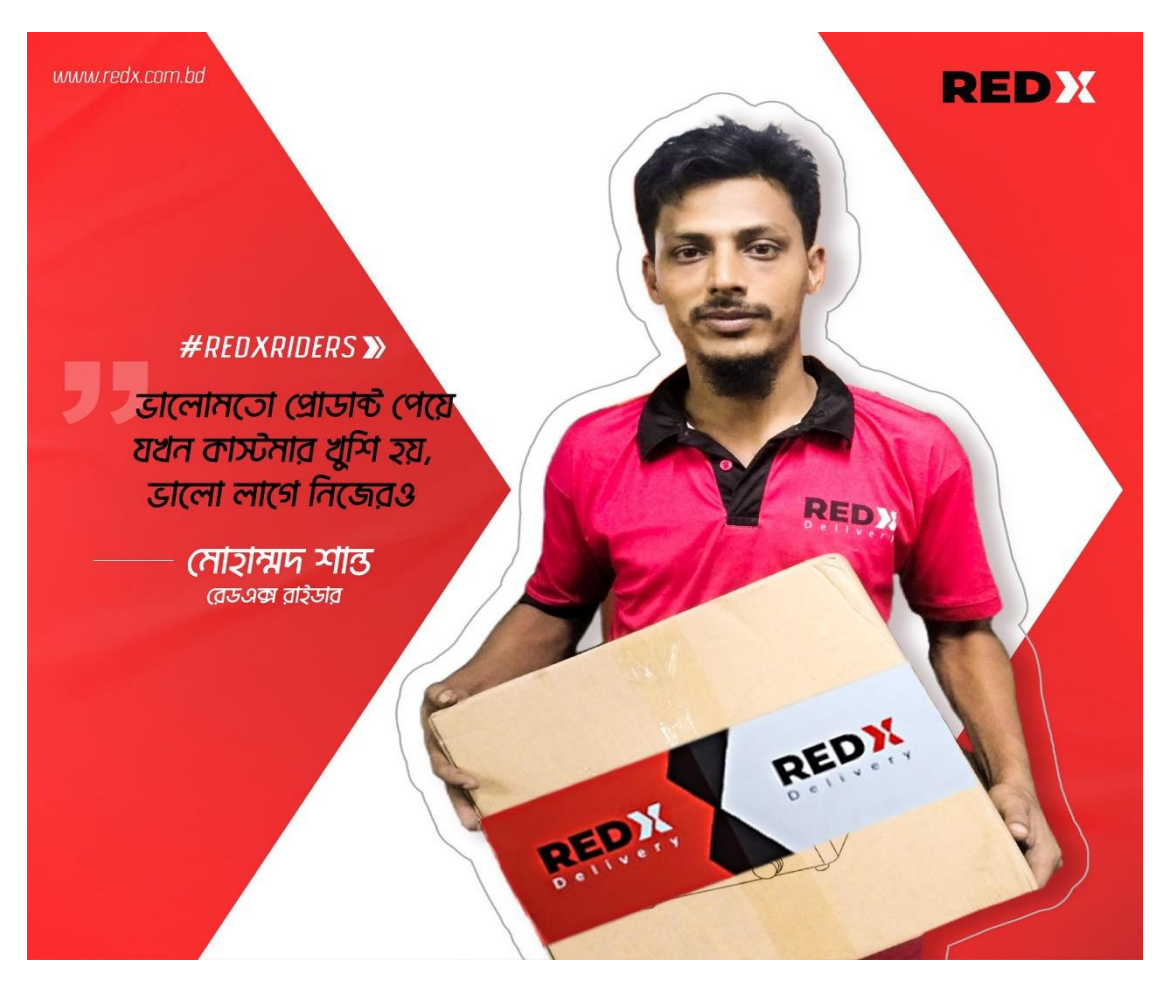
Figure: Pickup agent Pickedup Parcel

b. Pickup agent Pickedup Parcel : The Pickup Agent collects the Package from the Merchant After the Pickup Request.