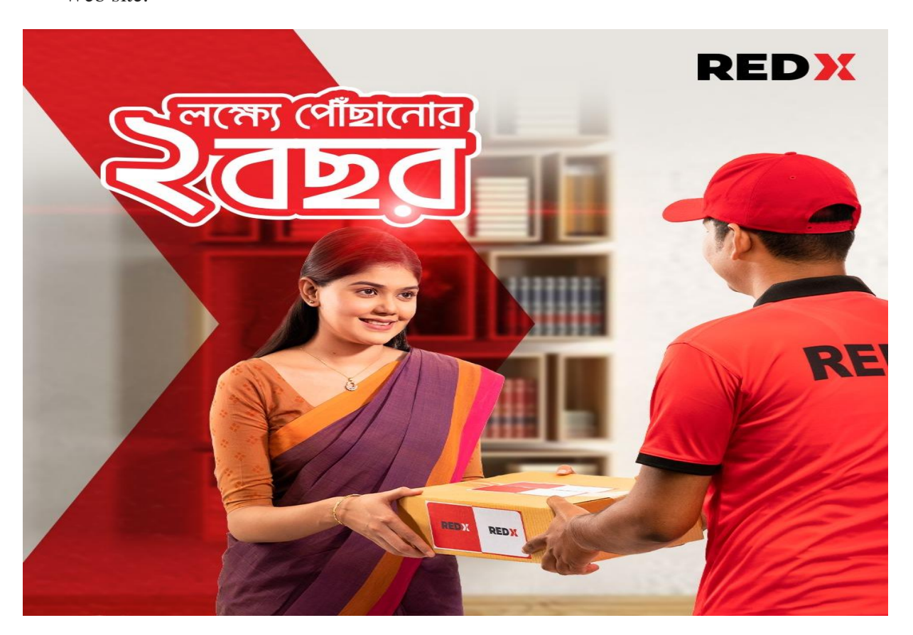
Figure : Redx Poster