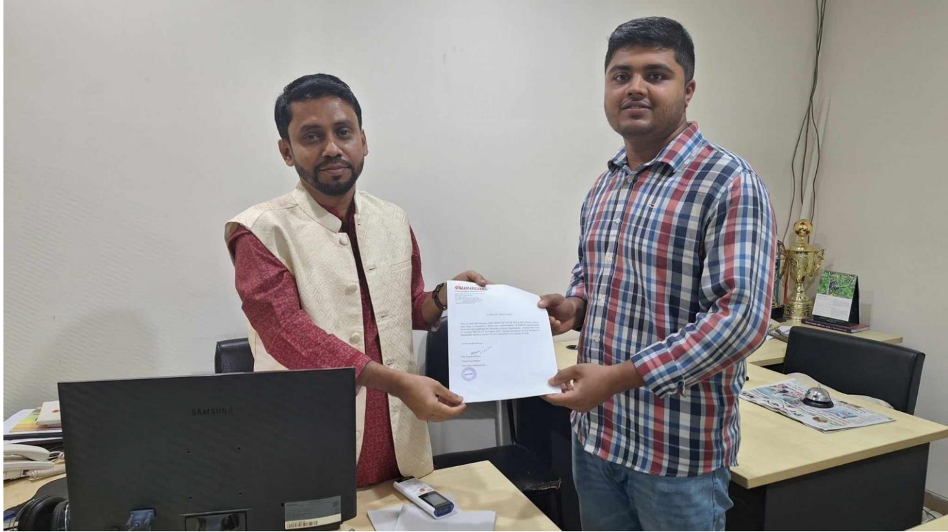
Received Intern Paper from my Intern Supervisor