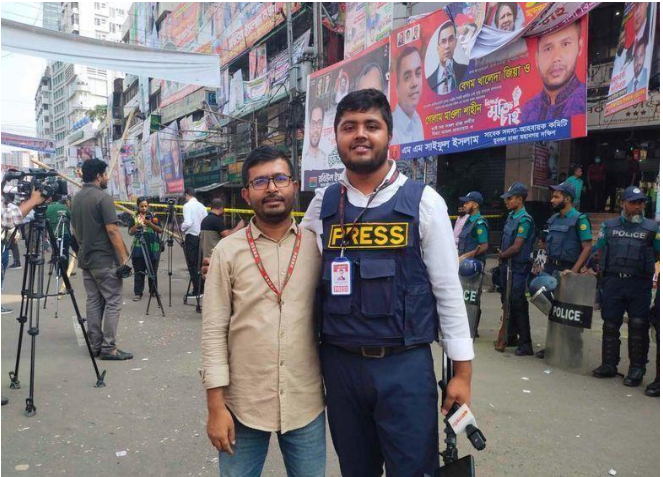
My working Time footage