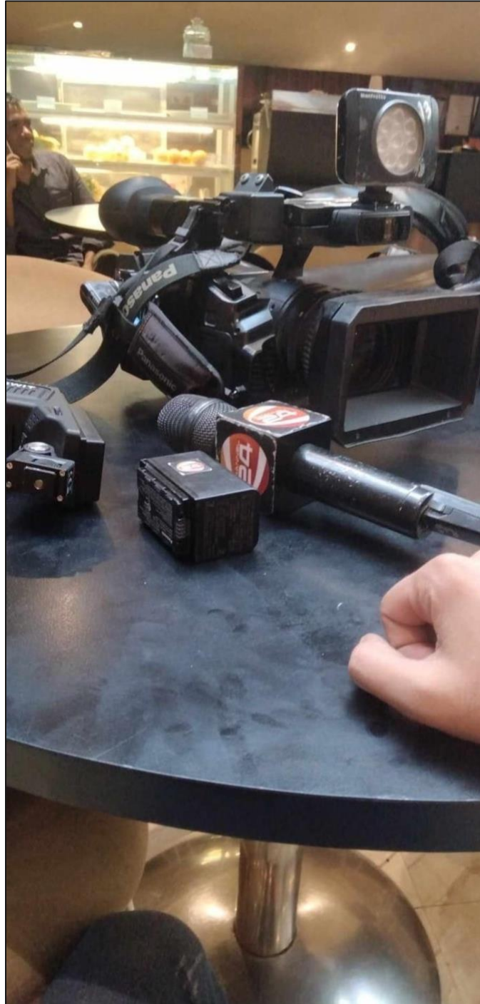
Tools I've used at every assignment