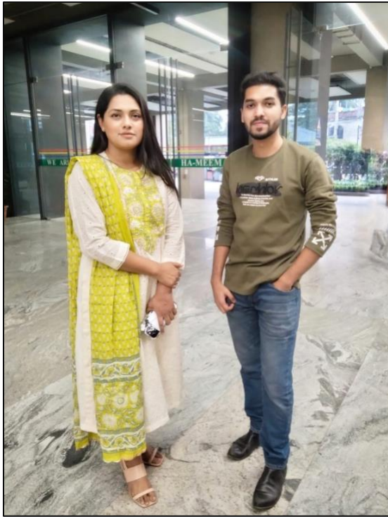
Attended celebrity guests visiting our studio for interviews and shows