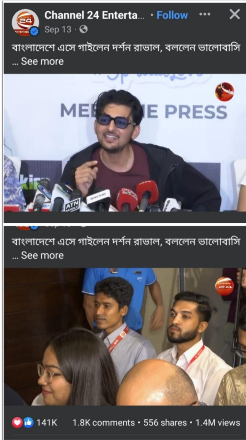
Interviewed Indian famous Singer and Composer, youth sensation Darshan Raval