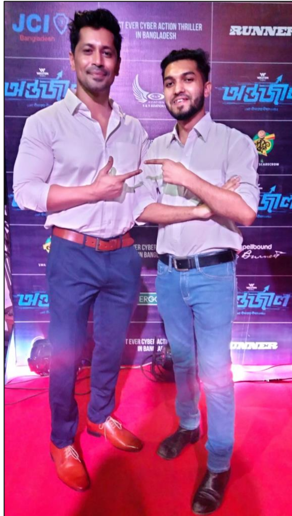
Interviewed famous Actor ABM Sumon at the premiere of the movie “Antarjal”