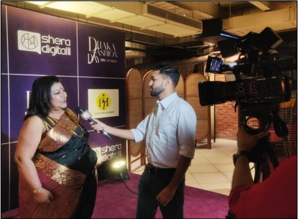
Interviewed some Indian celebrity at “Dhaka Fashion Day” 2023