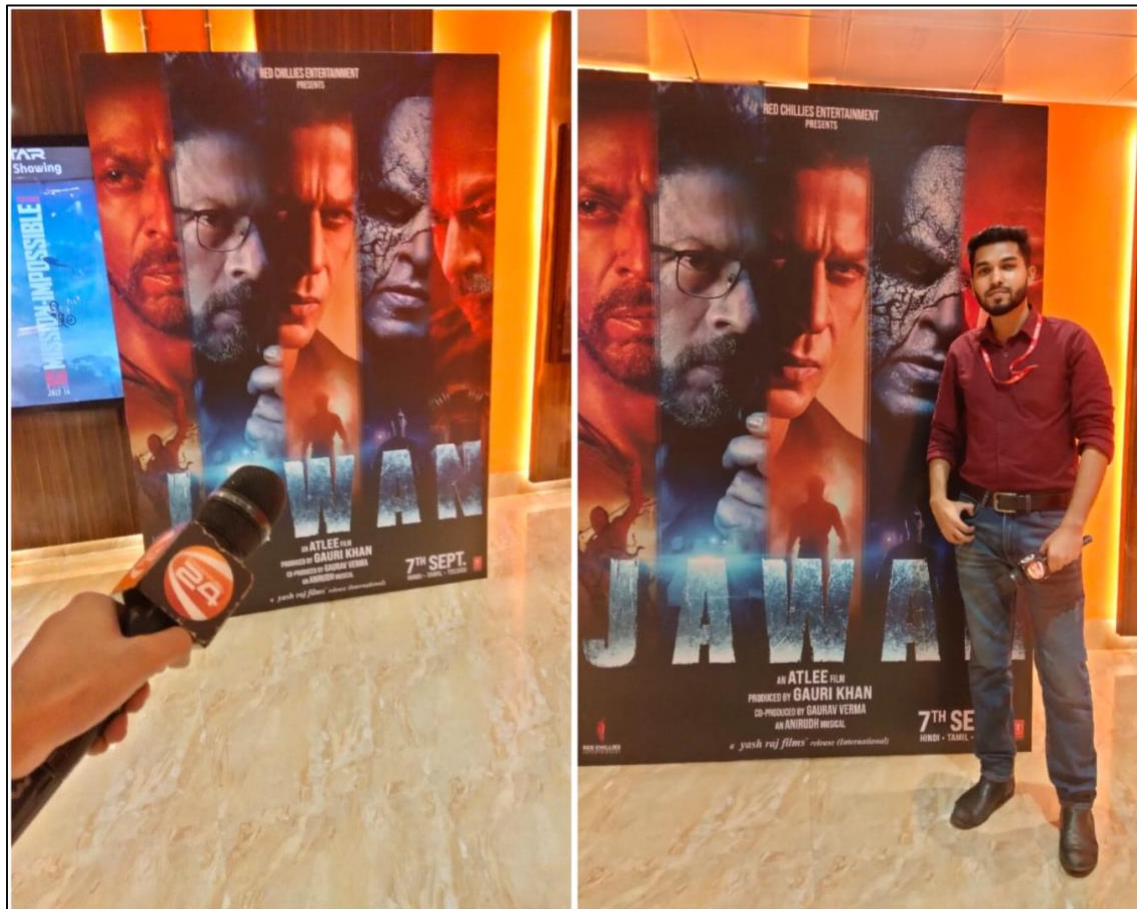
Interviewed excited viewers from the premiere of Jawan in Bangladesh