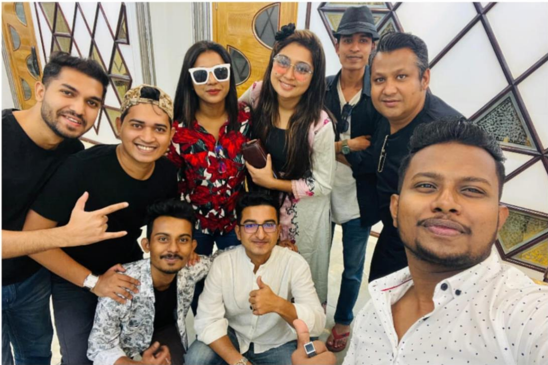
Went on a tour with the whole team of Entertainment and Lifestyle Department of Channel 24