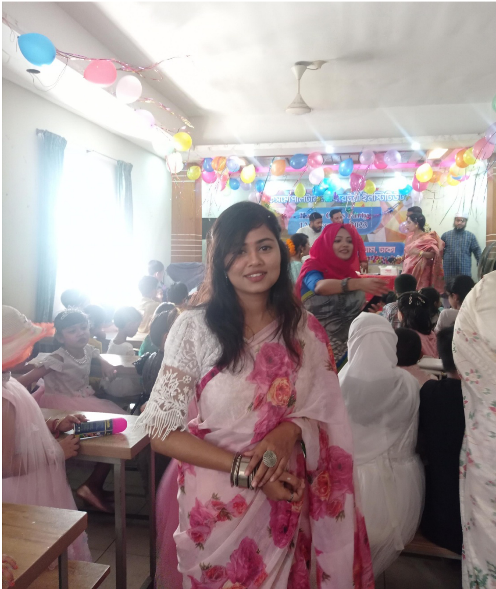
This picture is in the annual class party at Cosmopolitan Laboratory Institute.