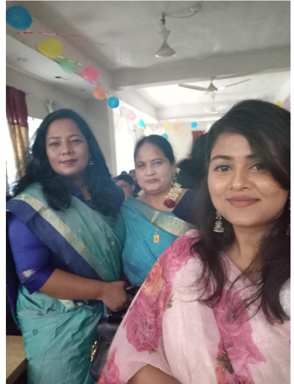
These pictures are with my respected colleagues.