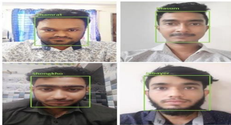
Fig. 4. Face Recognition using MobileNetV2