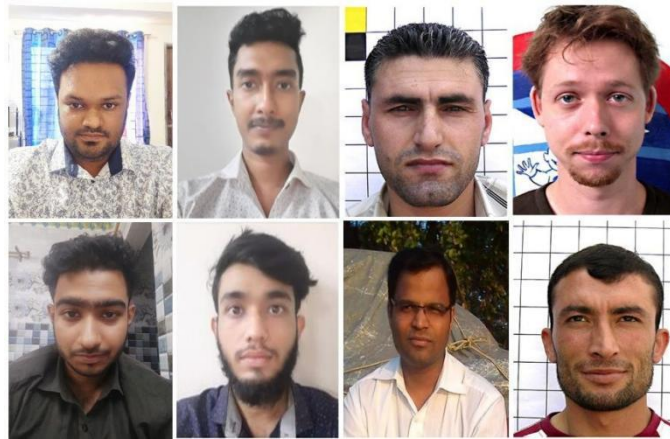
Fig. 2. Sample image data.

This study makes use of the LFW (Face Recognition) dataset ( https://www.kaggle.com/atulanandjha/lfwpeople ). Although there are over 13000 pictures in the collection, but only utilized 13000 pictures for our study. Each image is appropriately labeled with the person's name. A total of 104 photographs were used to build the data set. Figure 2 contains the sample data from the retrieved dataset.