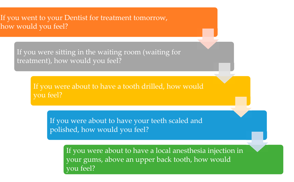
Figure 1. Modified dental anxiety scale.