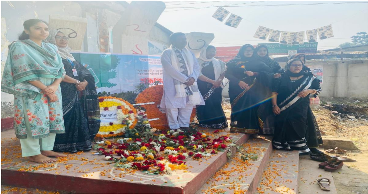
On International Mother Language Day