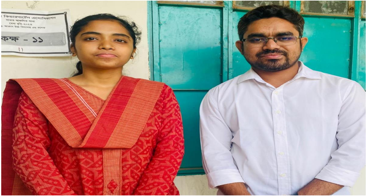
With an honorable Teacher .