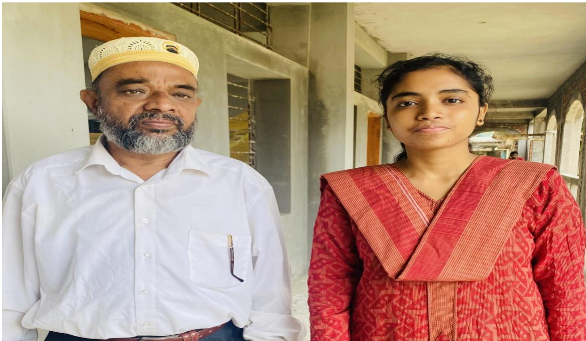
With honorable Teachers