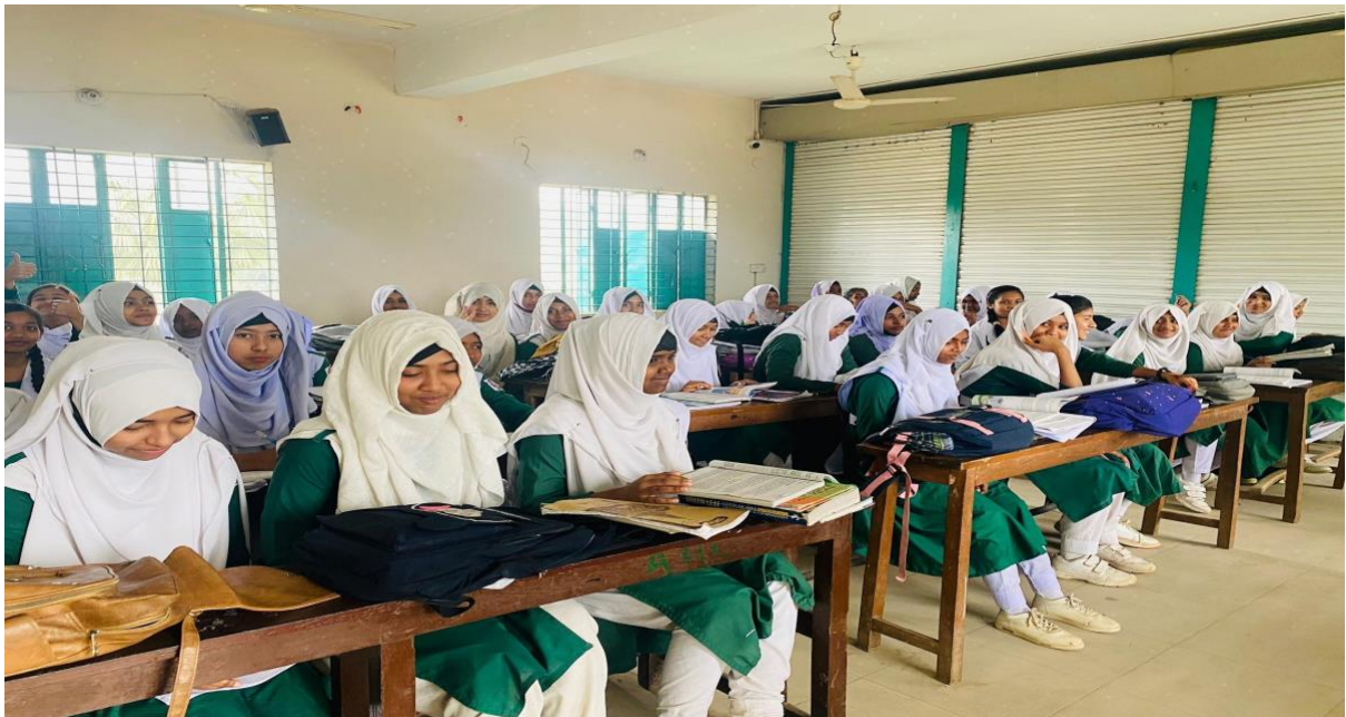
After taking class .