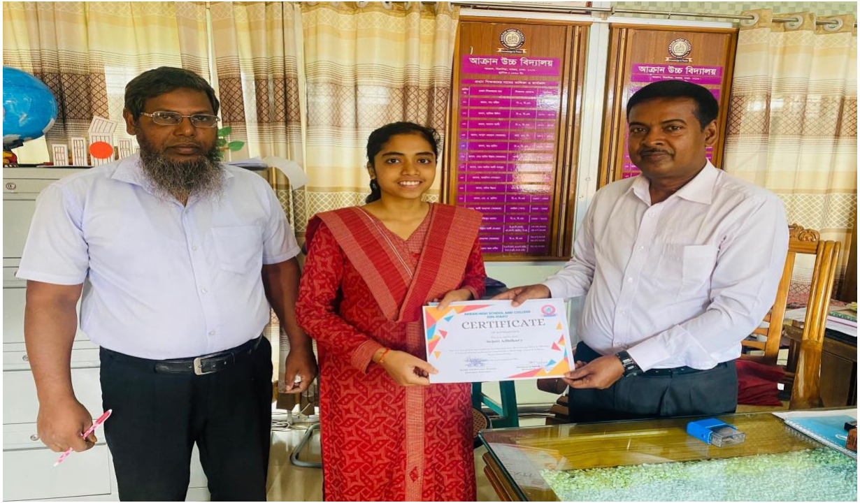
Honorable Principal Sir and Assistant principal Sir are giving the certificate.