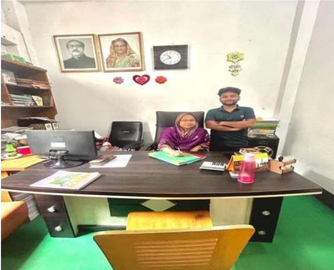
With the principal of Cambridge High School and College...