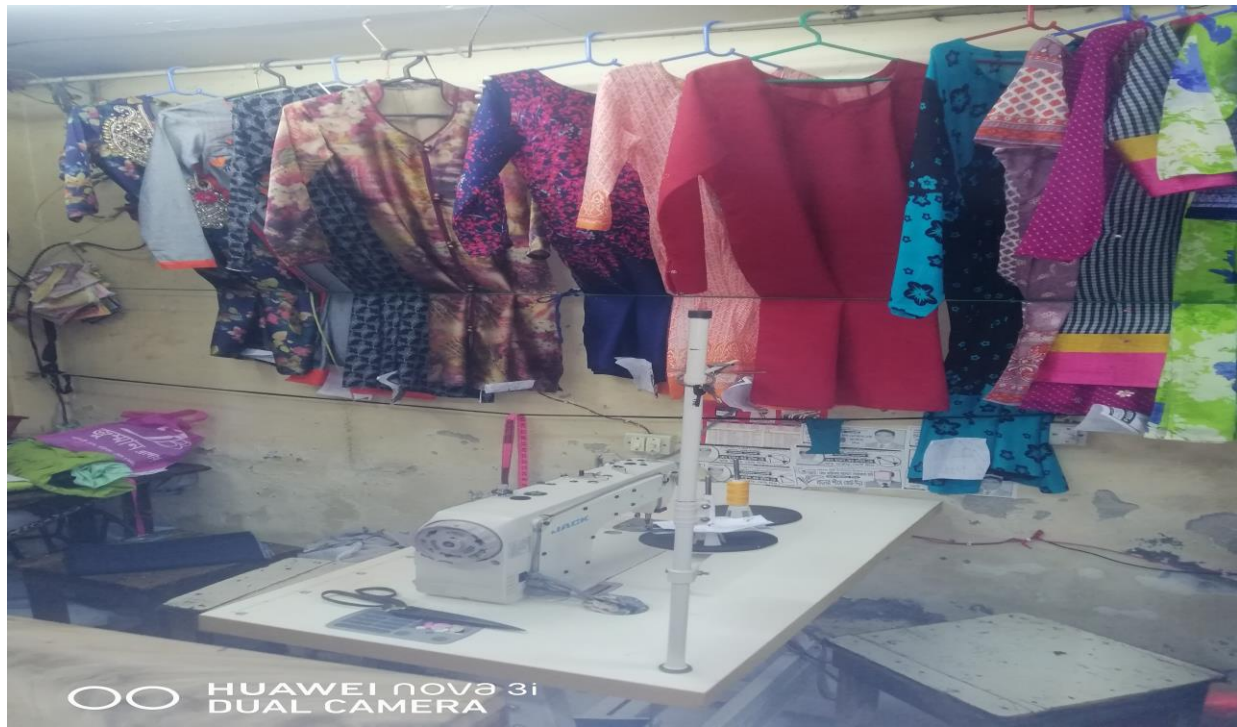
Fig 10:- Barishal sadar LadiesBoutique shops/Tailoring shops