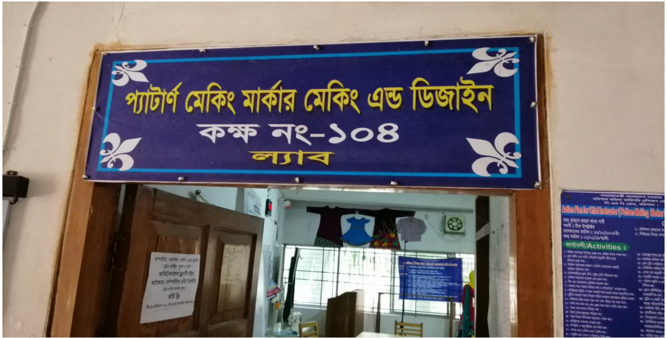
Fig 16 – Women Technical Training Center