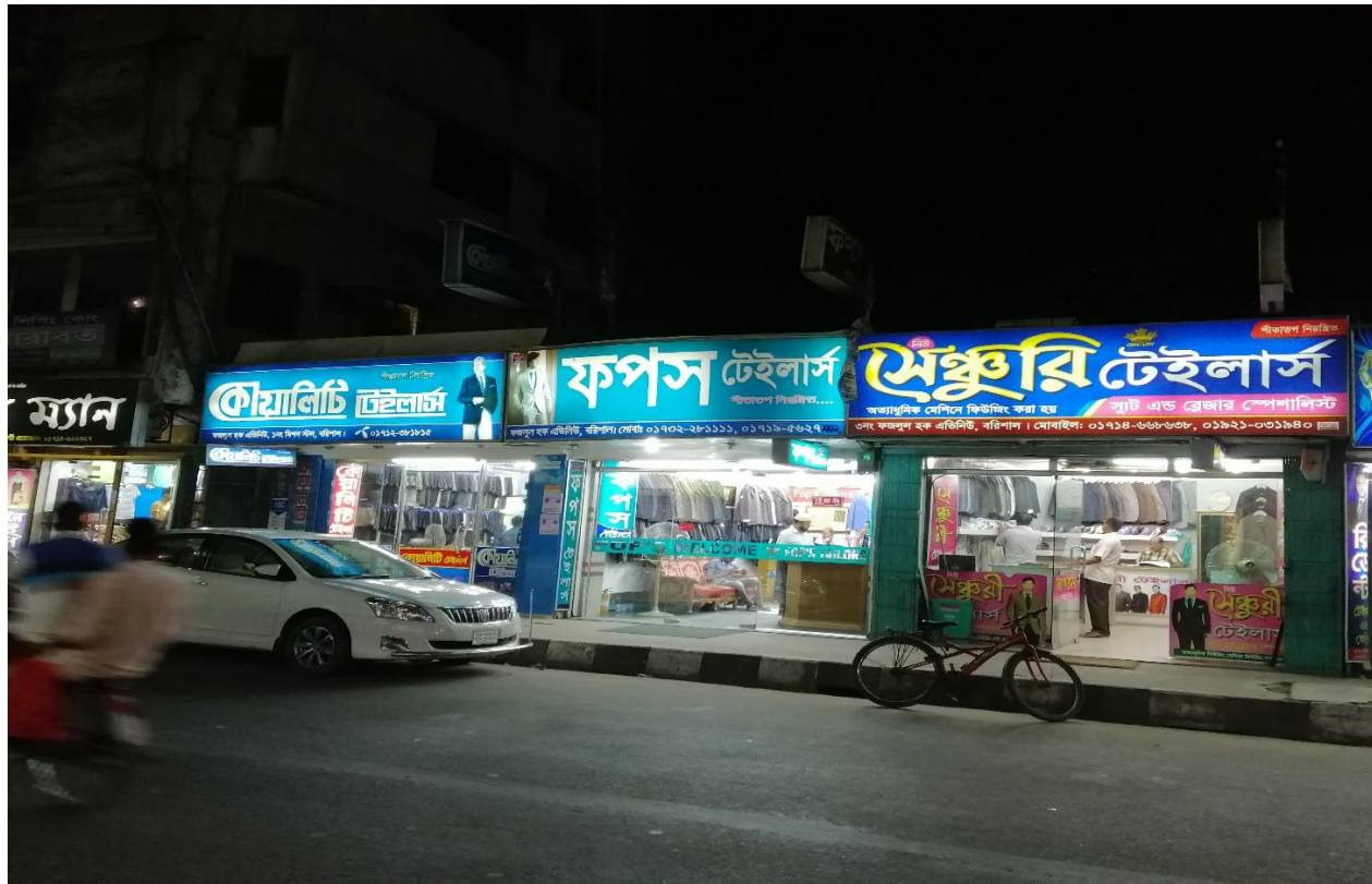
Fig 1: Barisal sadar GentsBoutique shops/ Tailoring shops