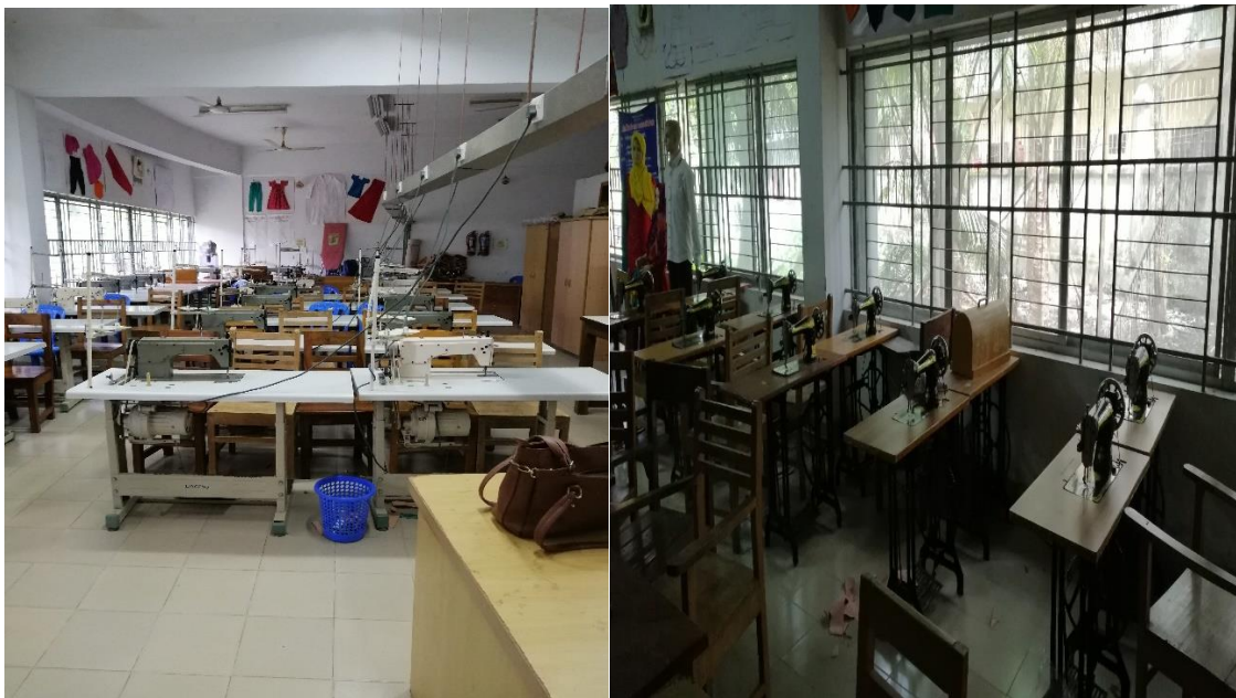
Fig 14:- Barishal sadar LadiesBoutique shops/Tailoring shops