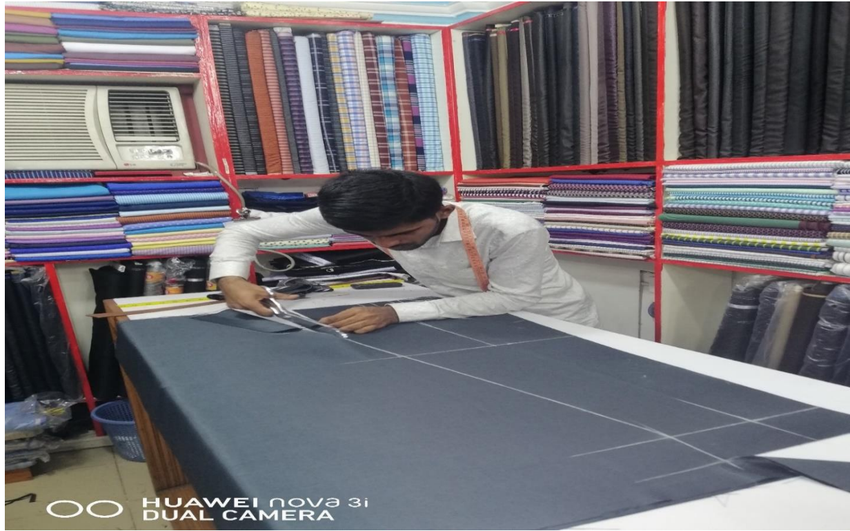
Fig 5: Barishal sadar GentsBoutique shops/Tailoring shops