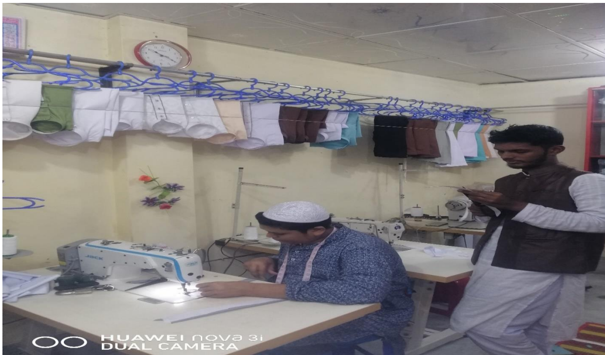
Fig 4: Barishal sadar GentsBoutique shops/Tailoring shops