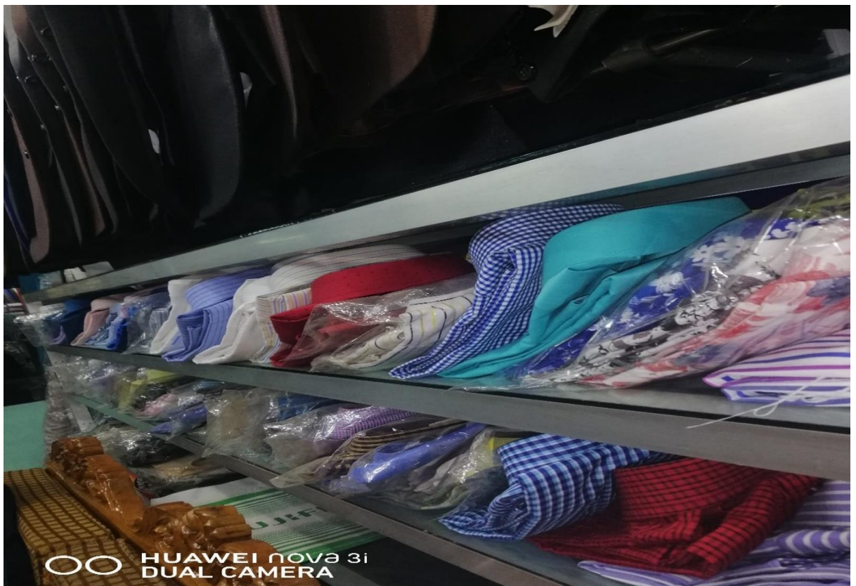
Fig 8: Barishal sadar GentsBoutique shops/Tailoring shops