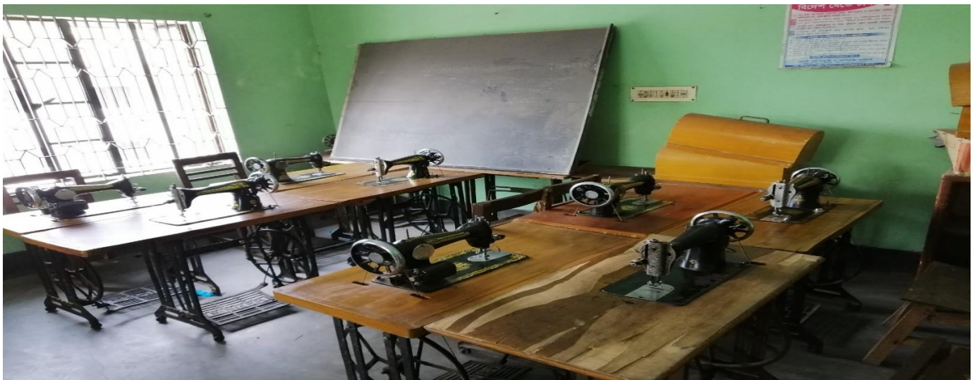
Fig 25- Department of youth development