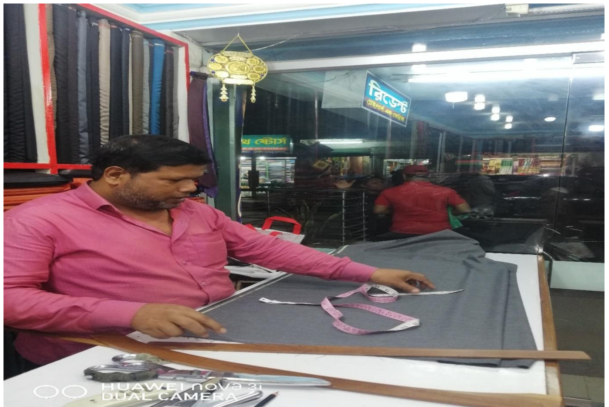
Fig 6: Barishal sadar GentsBoutique shops/Tailoring shops