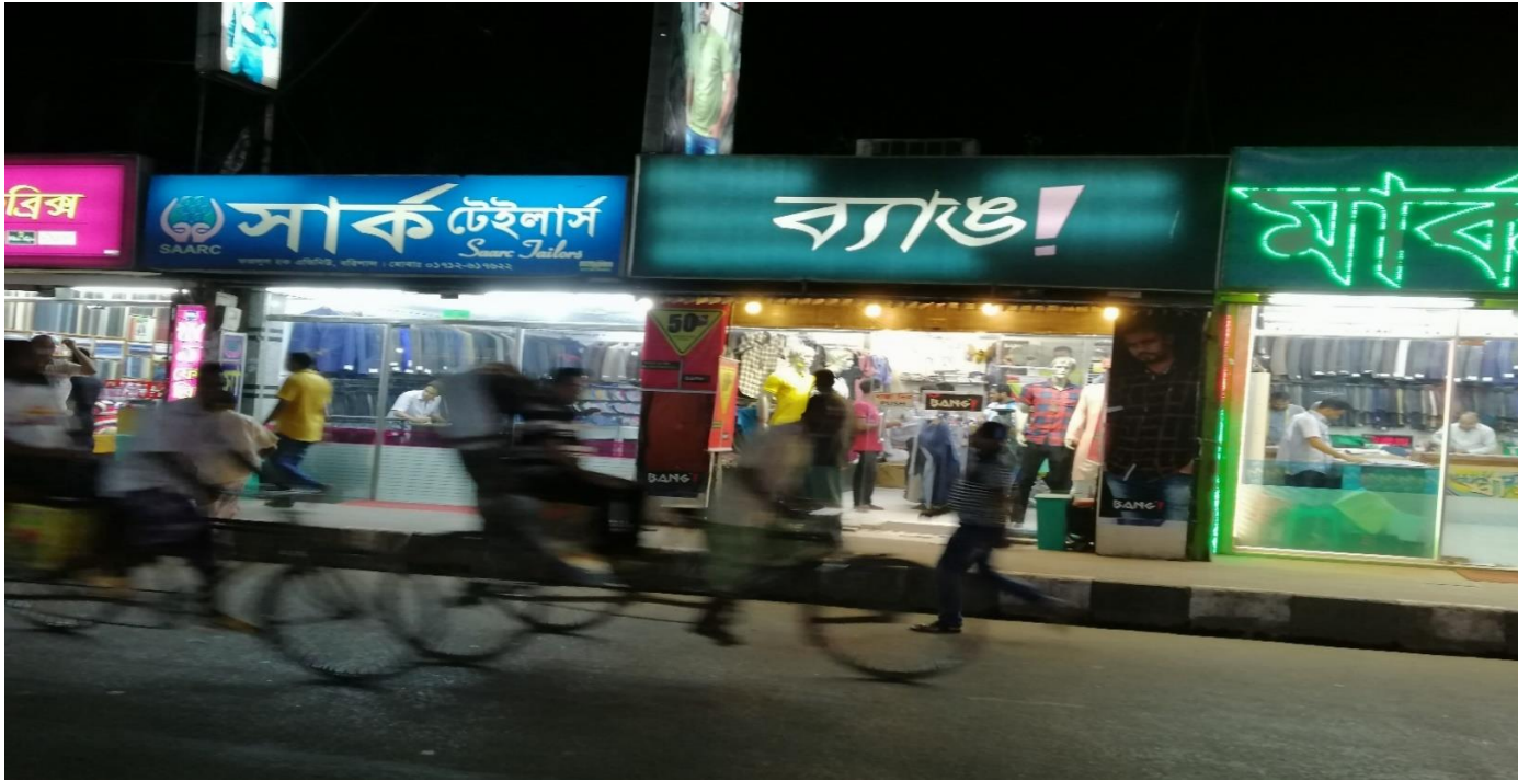
Fig 3: Barishal sadar GentsBoutique shops/Tailoring shops