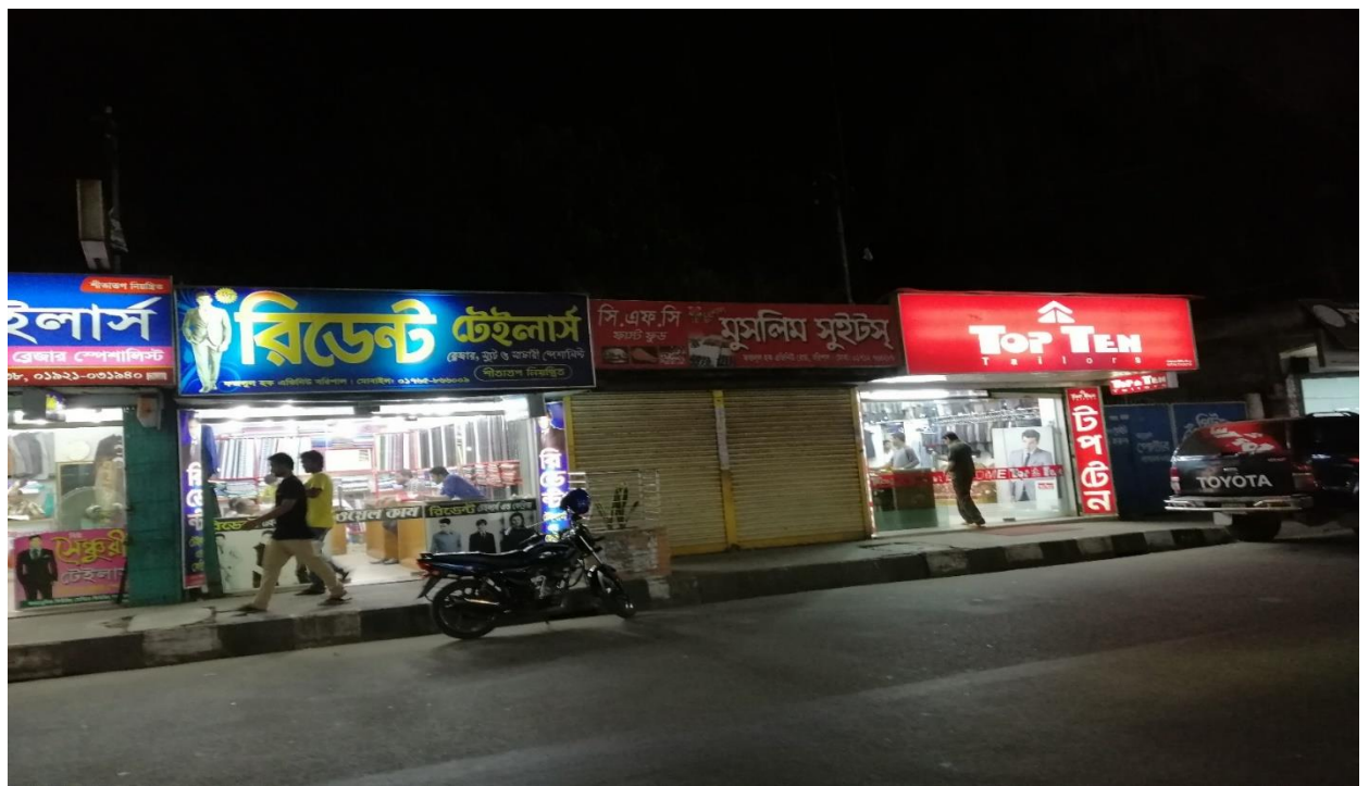
Fig 2: Barishal sadarBoutique shops/Tailoring shops