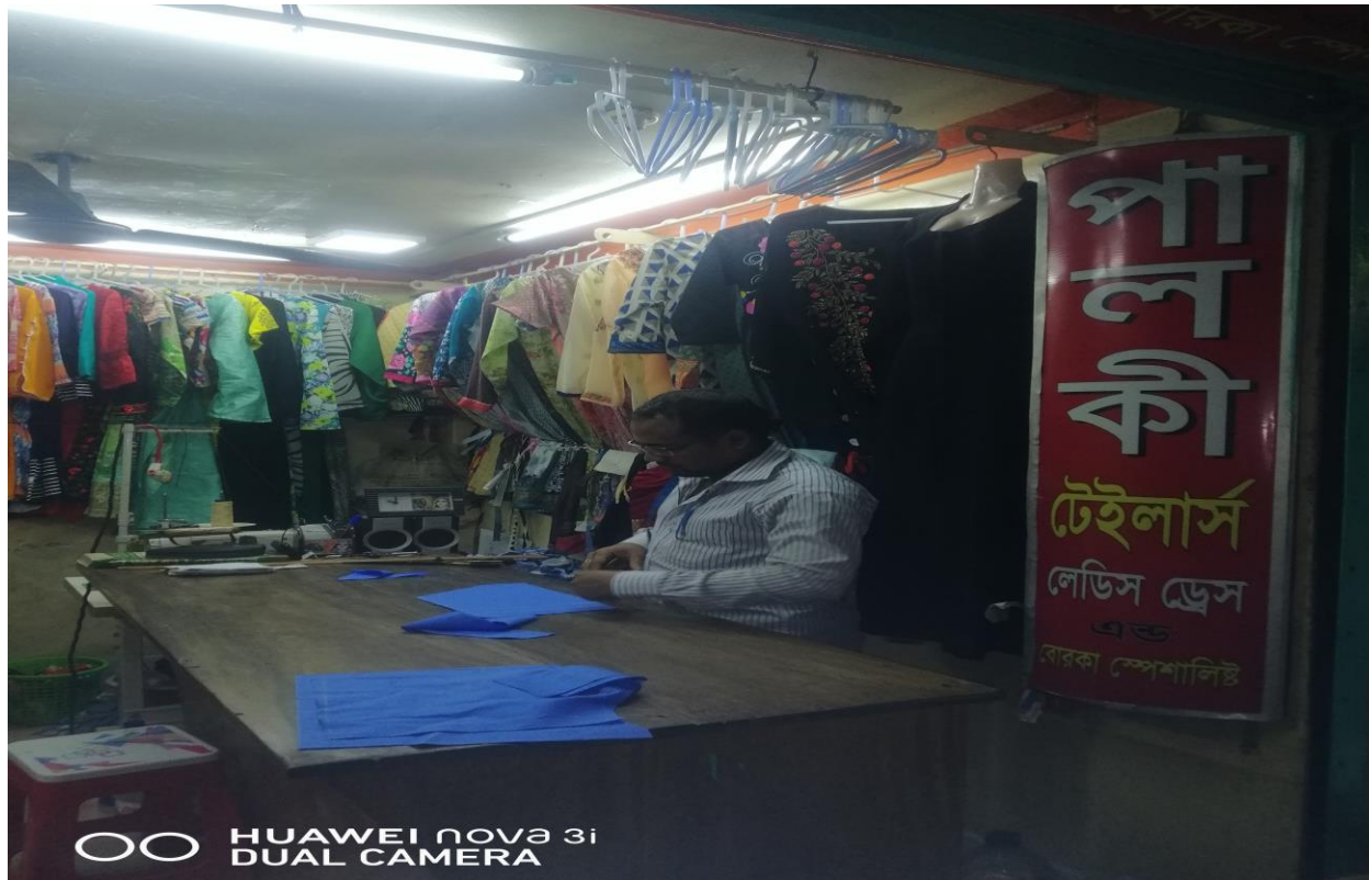
Fig 12:- Barishal sadar LadiesBoutique shops/Tailoring shops