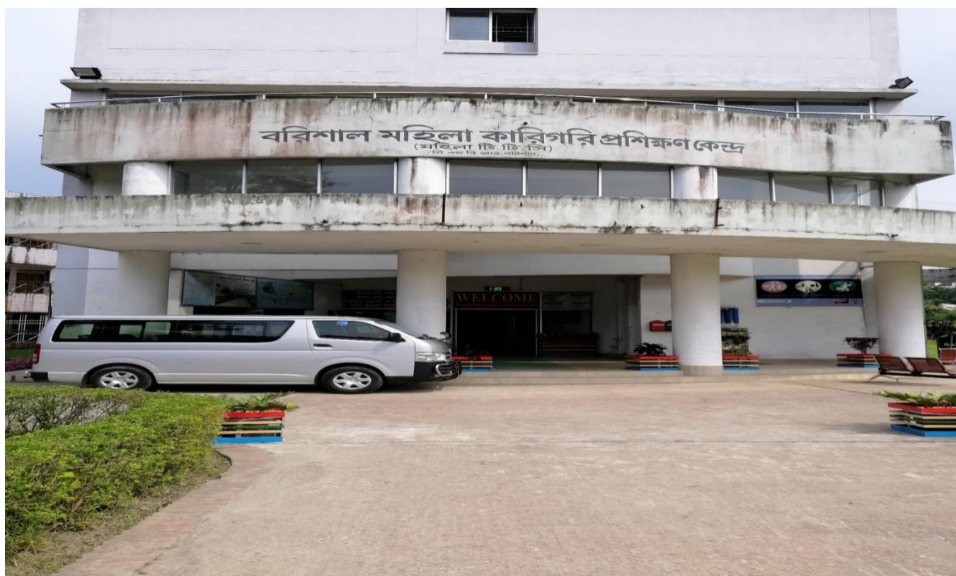
Fig 15 – Women Technical Training Center