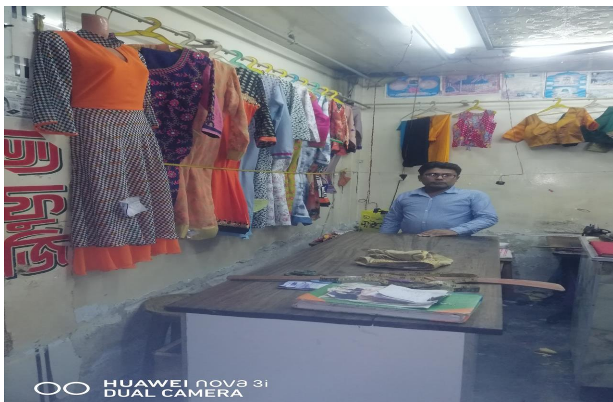
Fig 9:- Barishal sadar LadiesBoutique shops/Tailoring shops