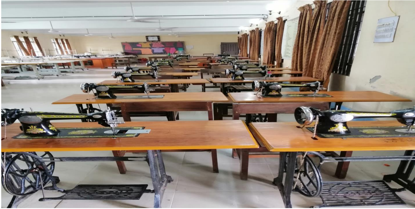
Fig 18 – Women Technical Training Center