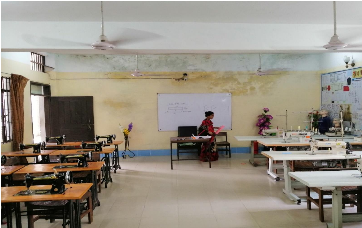
Fig 23 – Technical Training Center