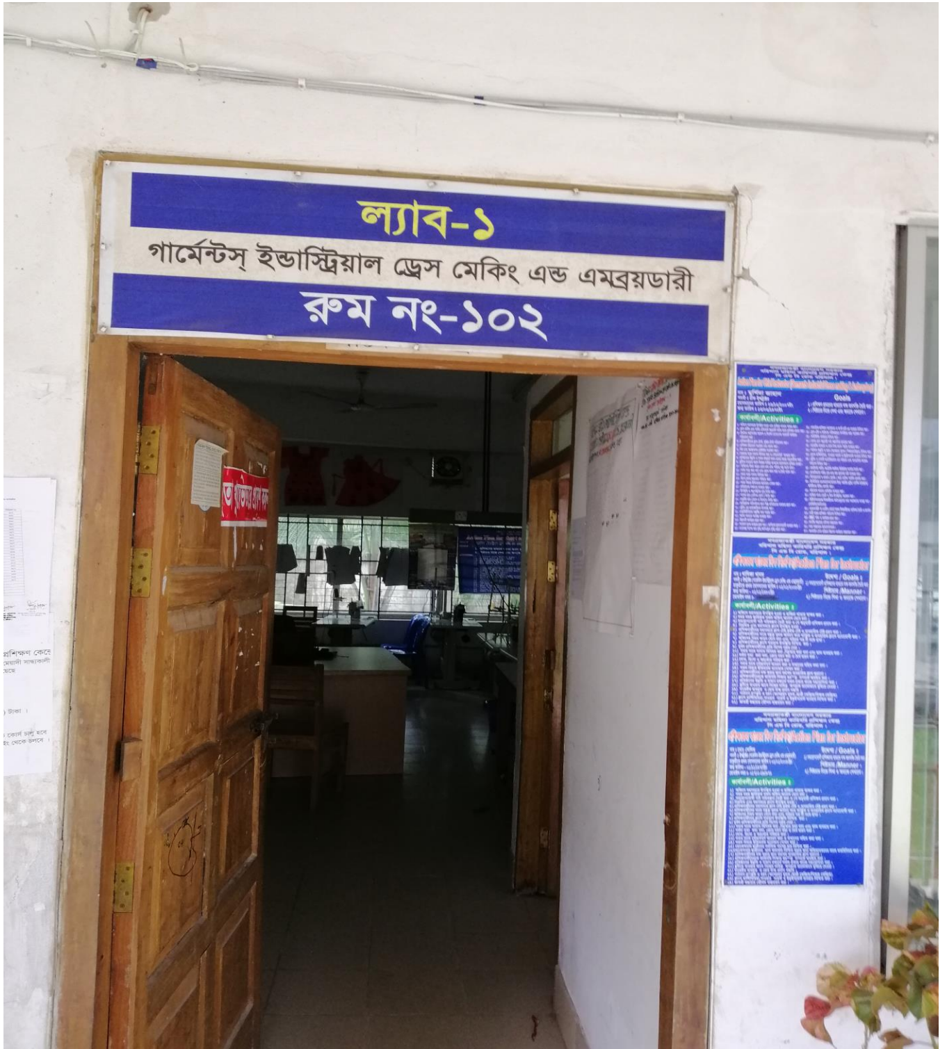
Fig 20-Women Technical Training Center