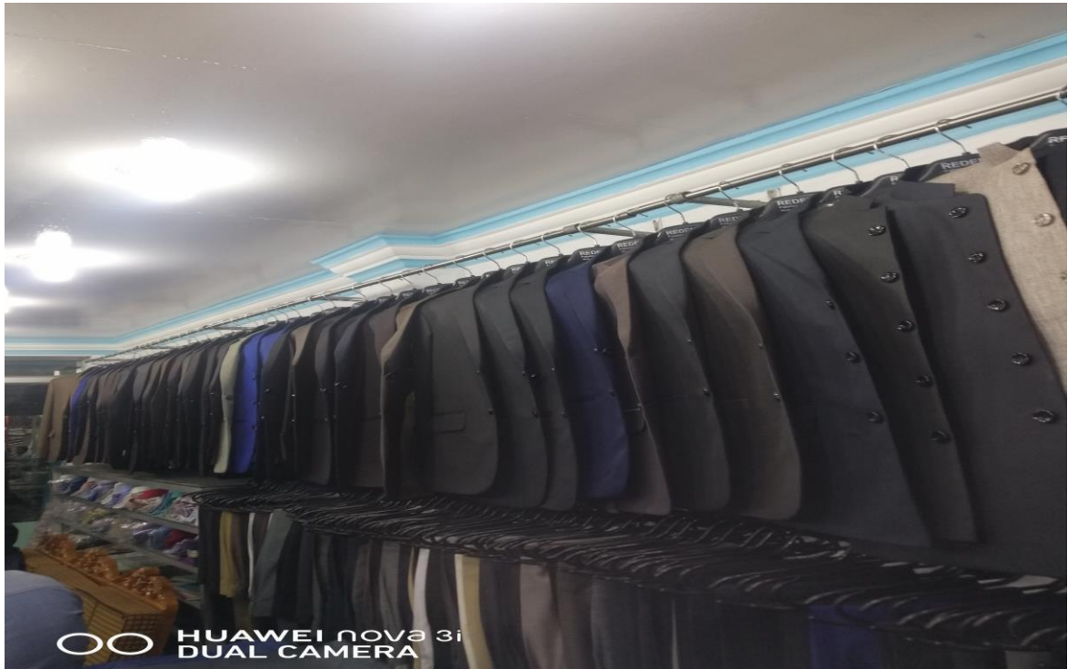
Fig 7: Barishal sadar GentsBoutique shops/Tailoring shops