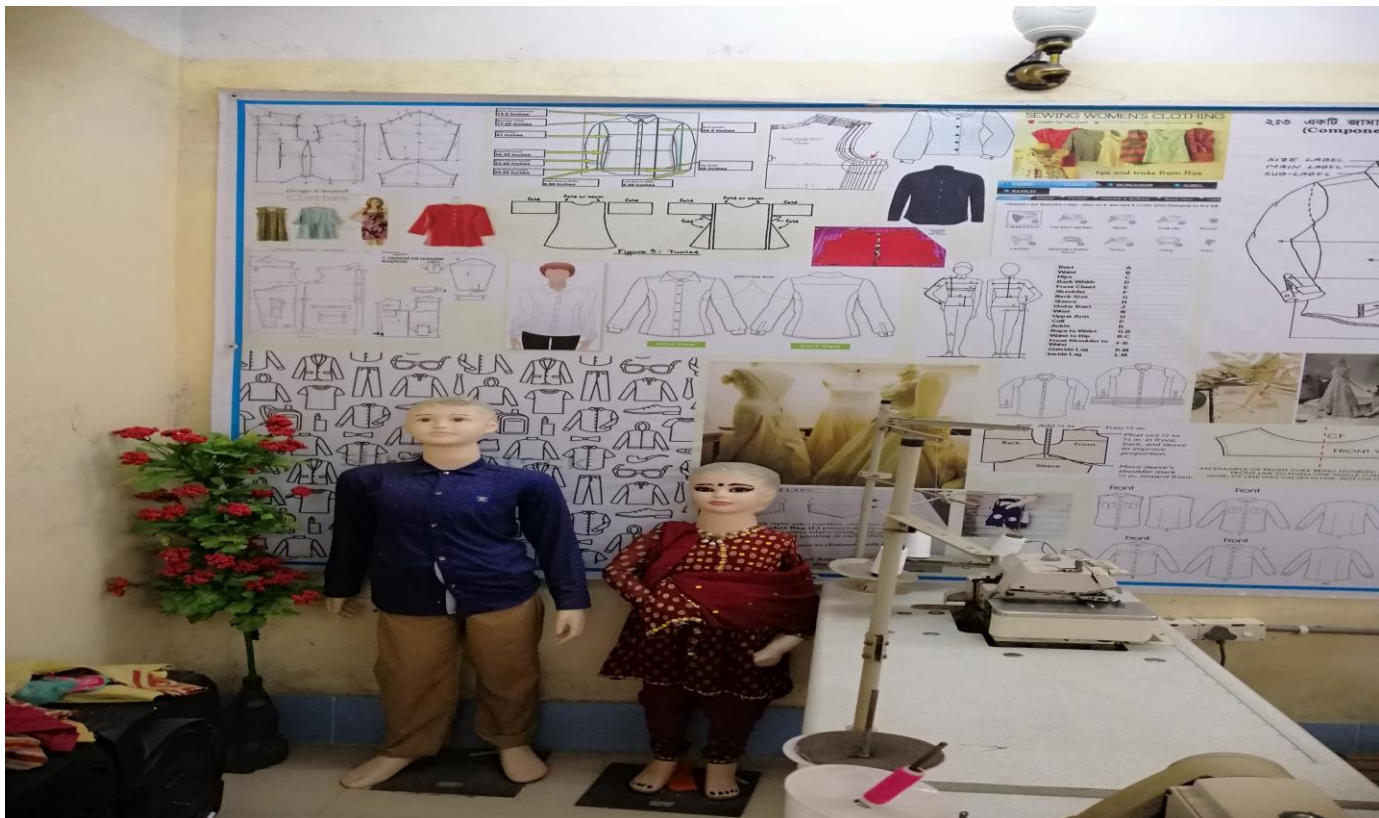
Fig 17 – Women Technical Training Center