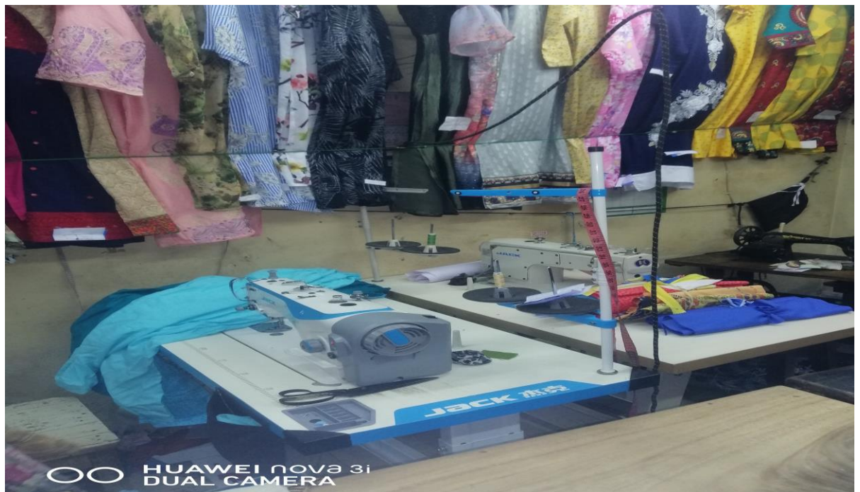
Fig 11:- Barishal sadar LadiesBoutique shops/Tailoring shops