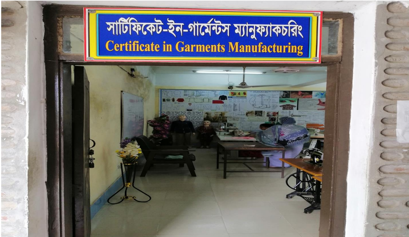
Fig 22 – Technical Training Center