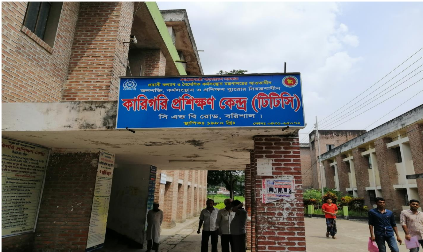
Fig 21 – Technical Training Center