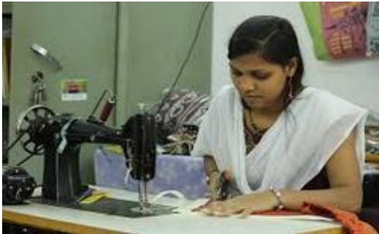
Fig 13:- Barishal sadar LadiesBoutique shops/Tailoring shops