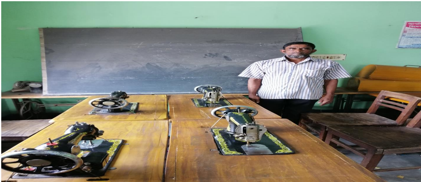
Fig 24 – Department of youth development