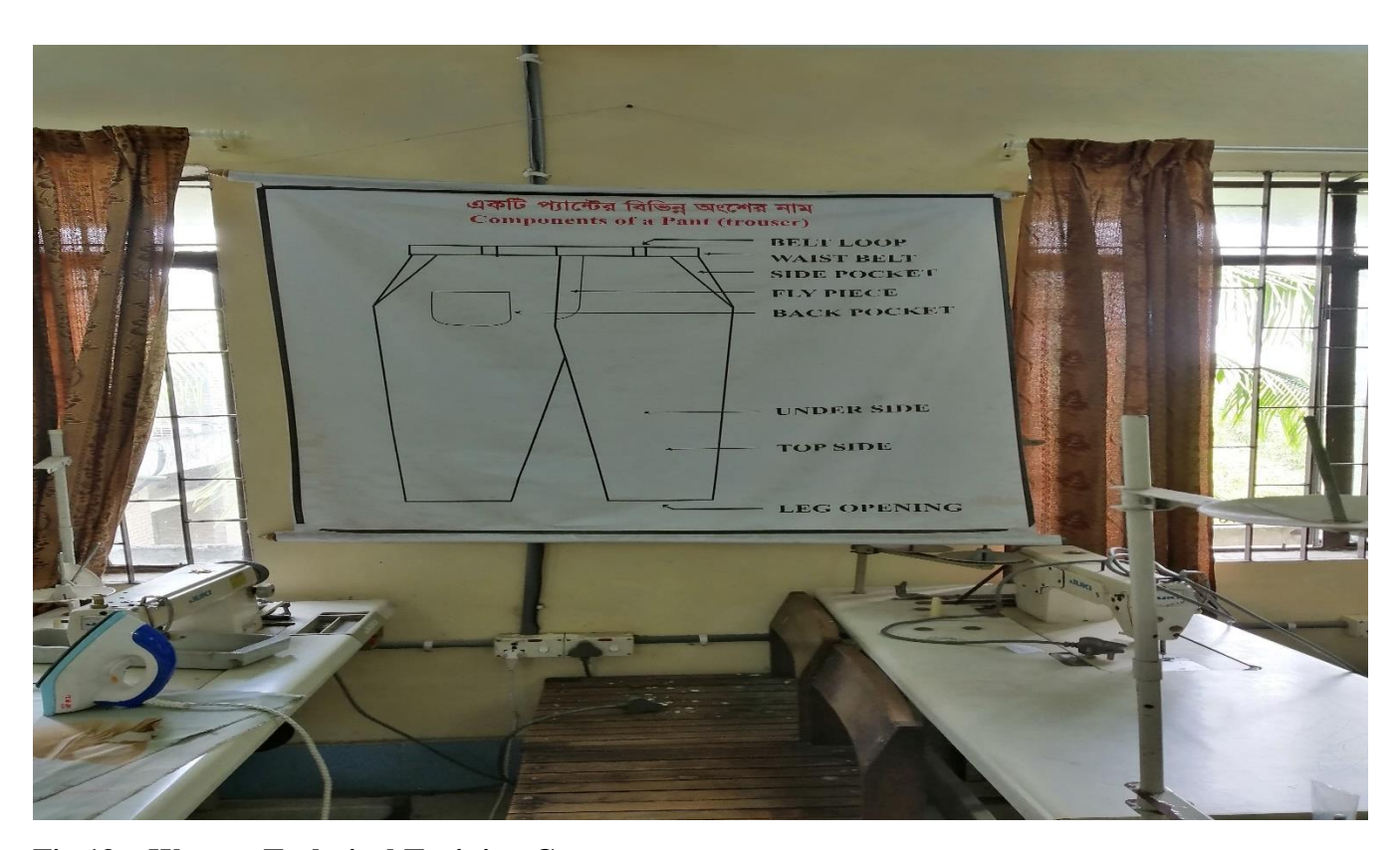
Fig 19 – Women Technical Training Center