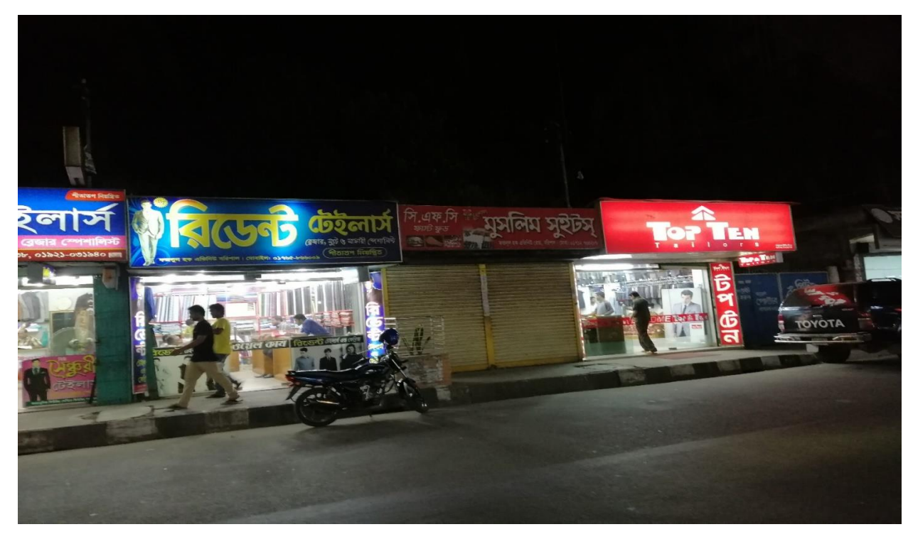
Fig 2: Barishal sadarBoutique shops/Tailoring shops