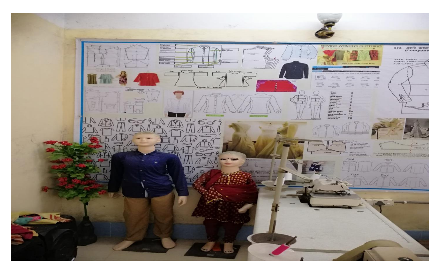
Fig 17 – Women Technical Training Center