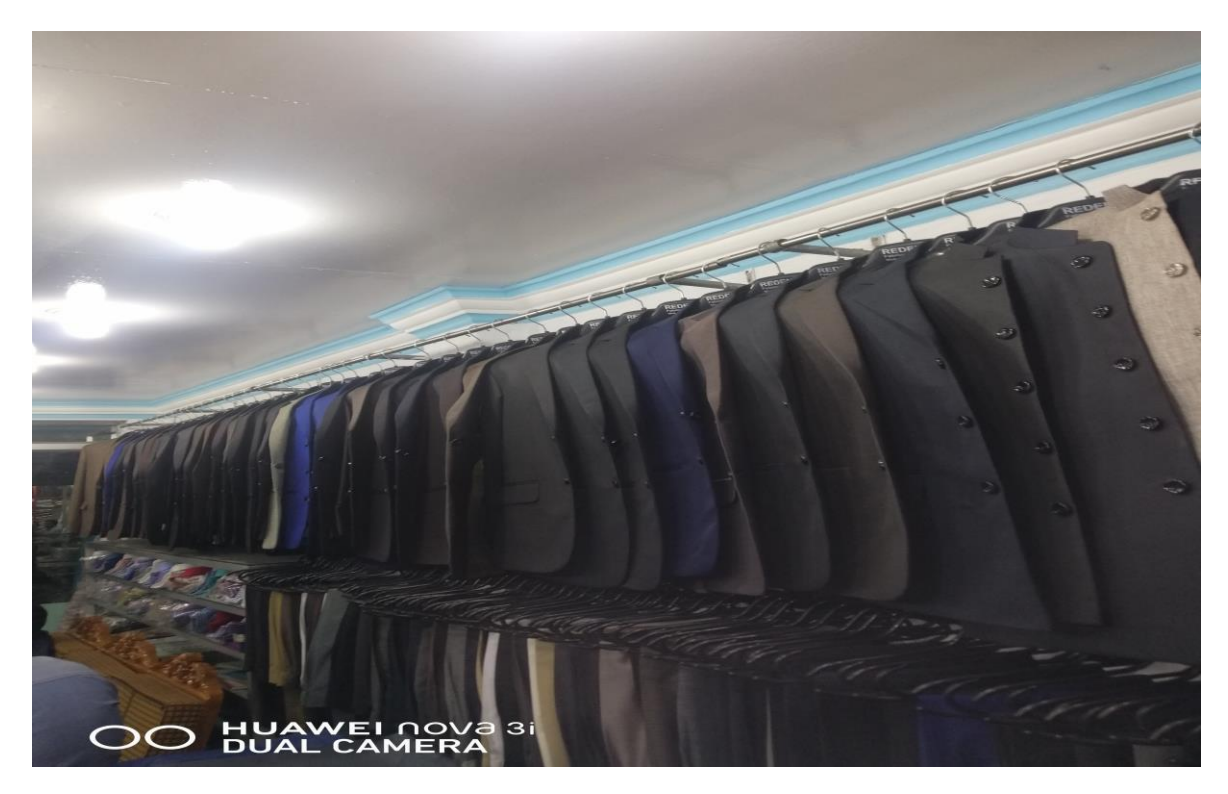
Fig 7: Barishal sadar GentsBoutique shops/Tailoring shops