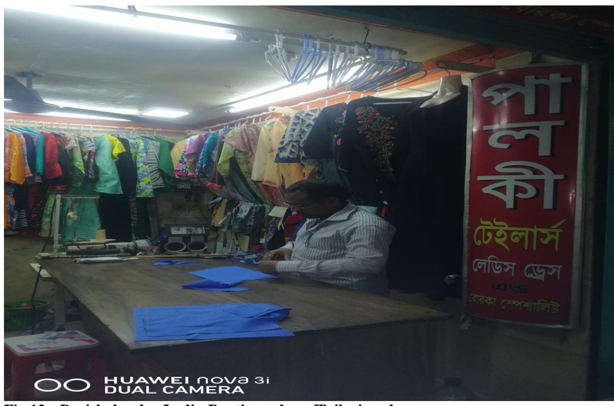
Fig 12:- Barishal sadar LadiesBoutique shops/Tailoring shops