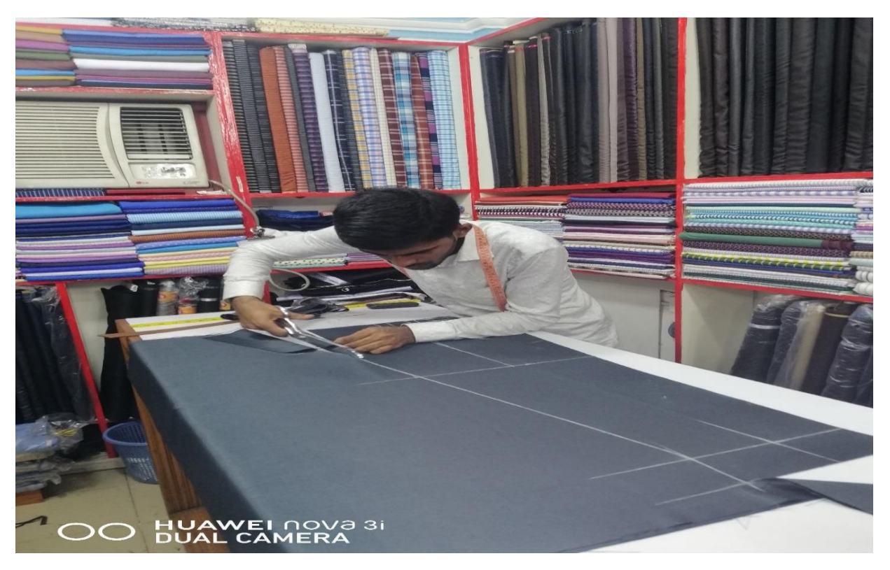
Fig 5: Barishal sadar GentsBoutique shops/Tailoring shops