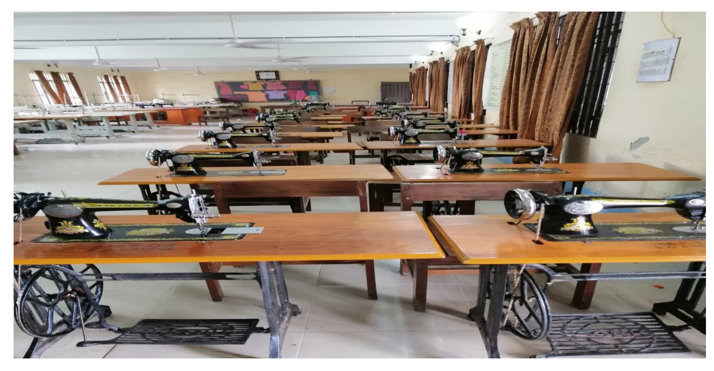
Fig 18 – Women Technical Training Center