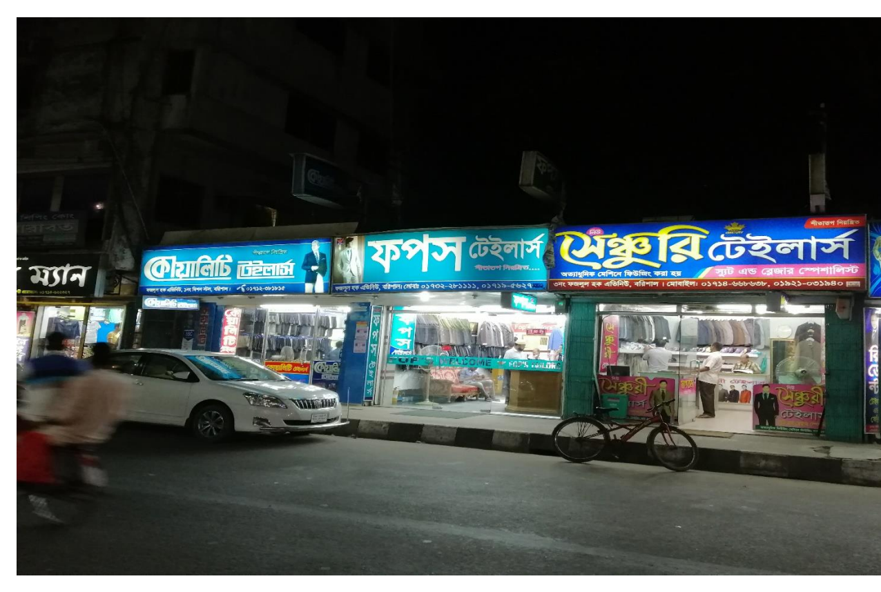
Fig 1: Barisal sadar GentsBoutique shops/ Tailoring shops