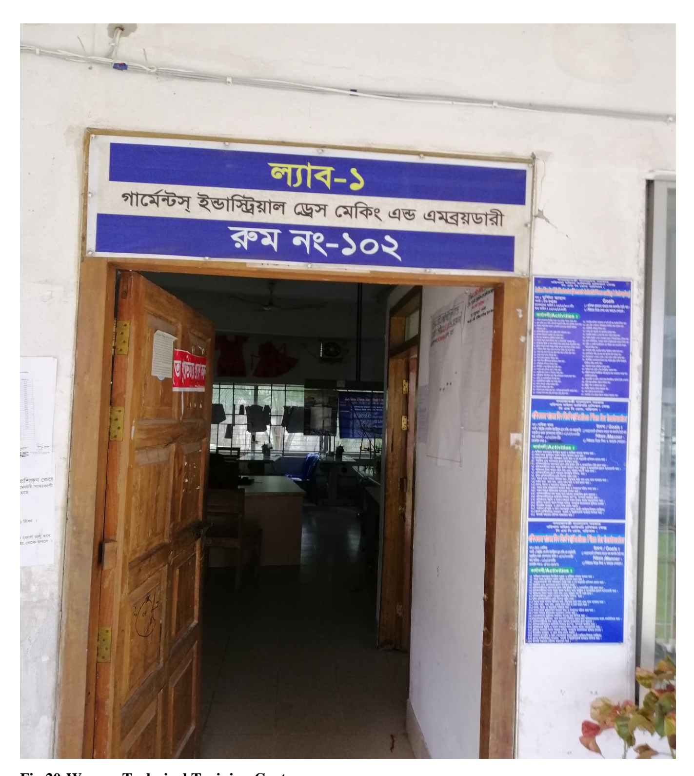
Fig 20-Women Technical Training Center