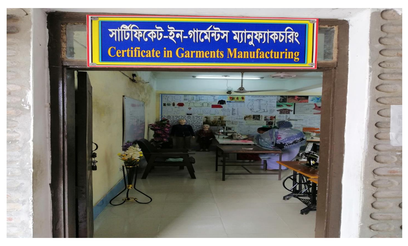
Fig 22 – Technical Training Center