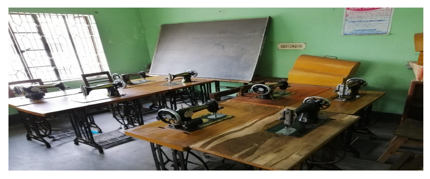
Fig 25- Department of youth development