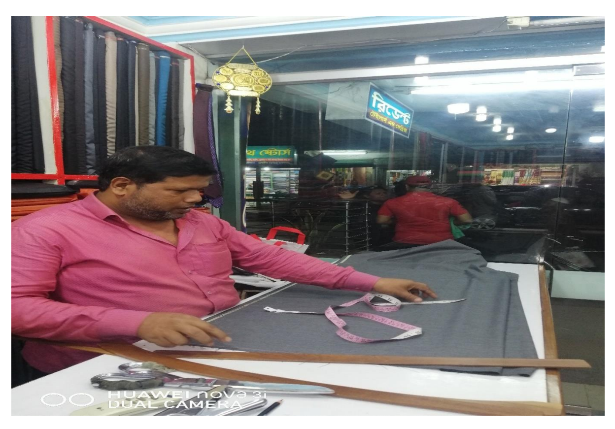
Fig 6: Barishal sadar GentsBoutique shops/Tailoring shops