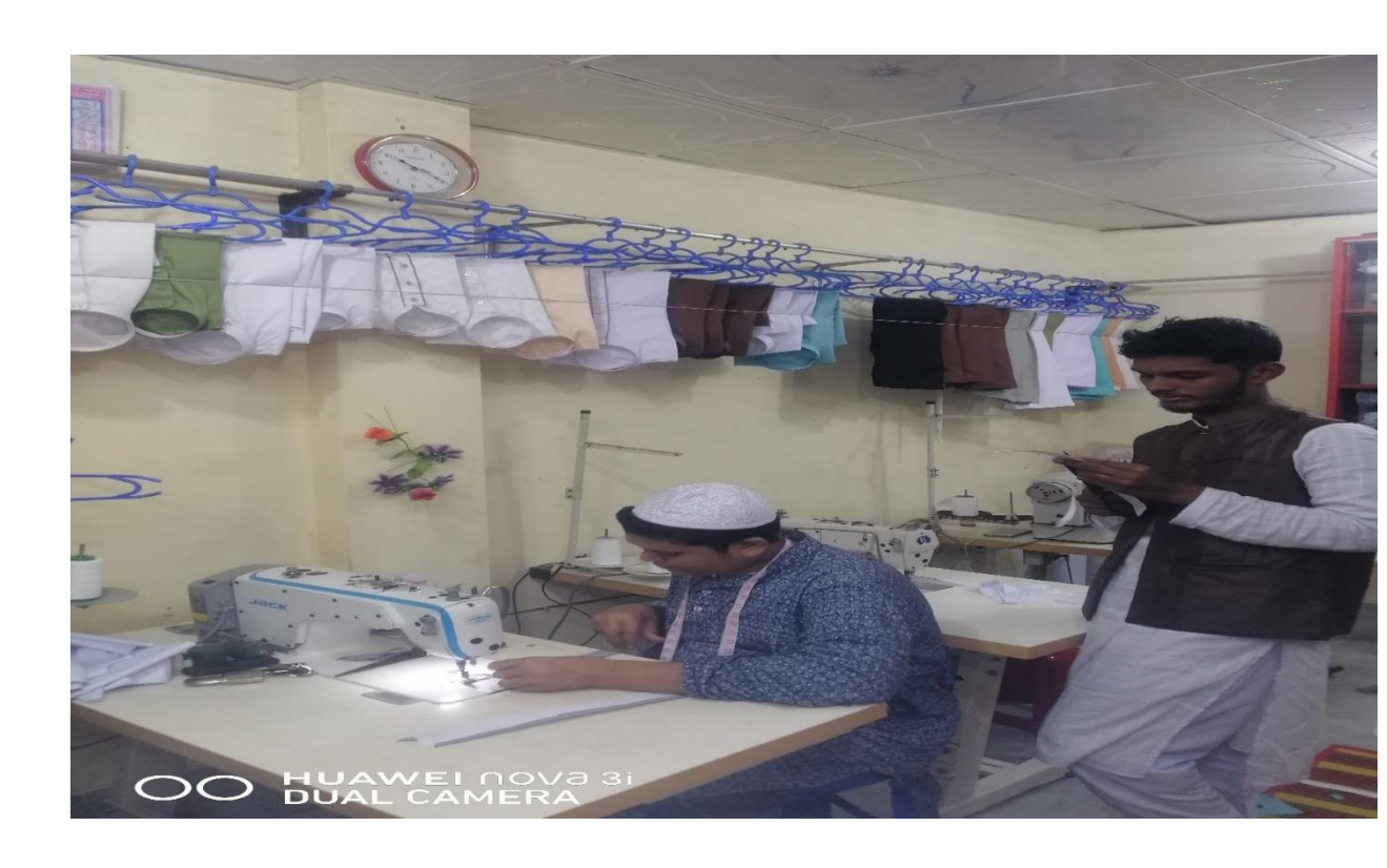
Fig 4: Barishal sadar GentsBoutique shops/Tailoring shops