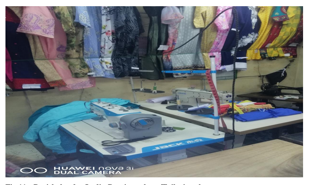
Fig 11:- Barishal sadar LadiesBoutique shops/Tailoring shops