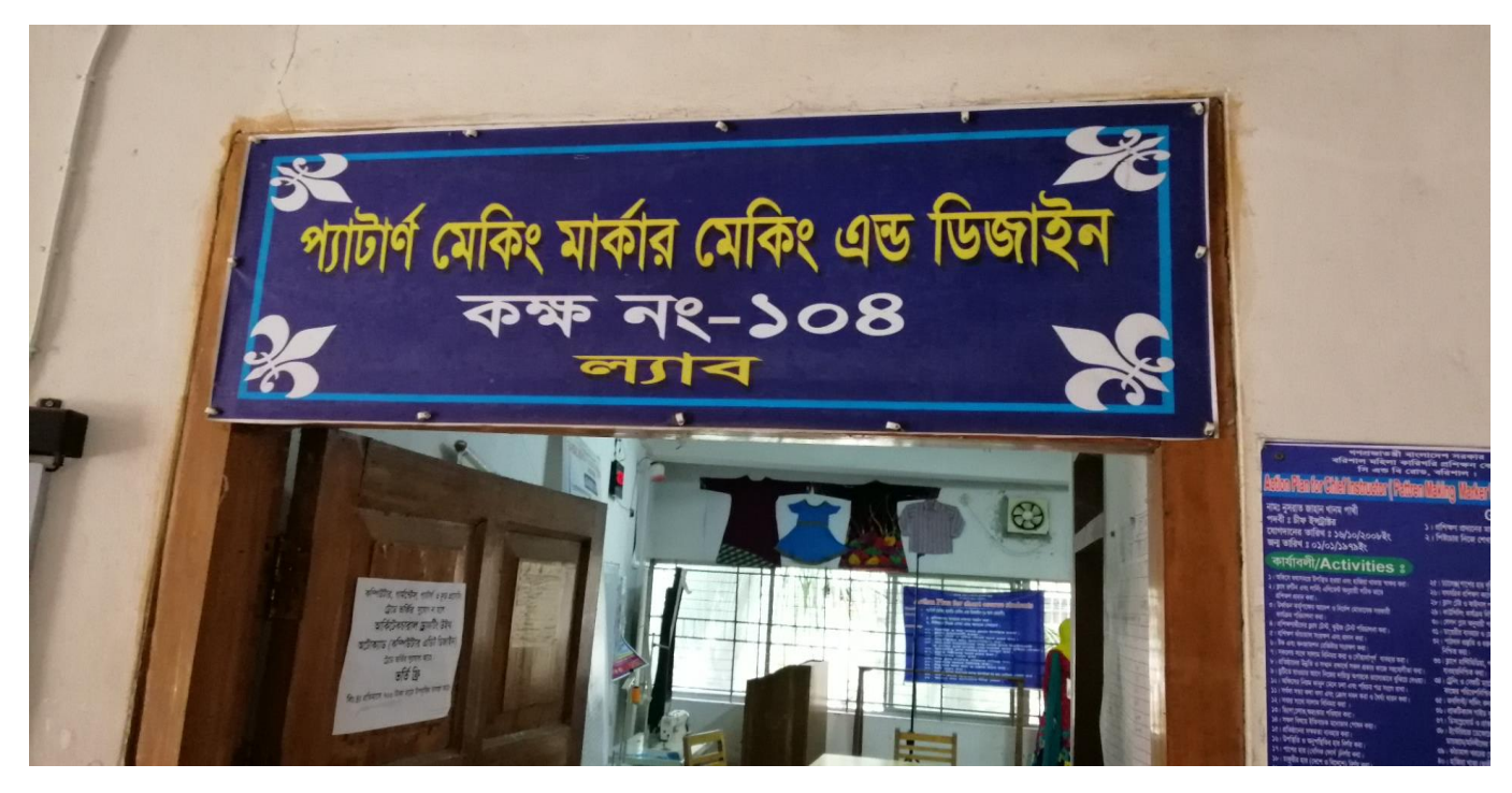
Fig 16 – Women Technical Training Center