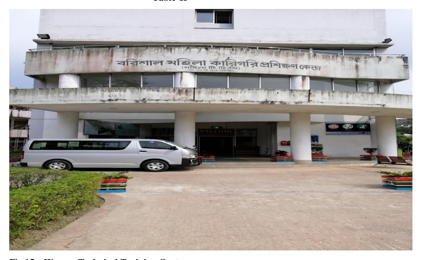
Fig 15 – Women Technical Training Center