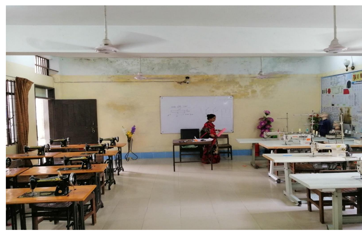
Fig 23 – Technical Training Center