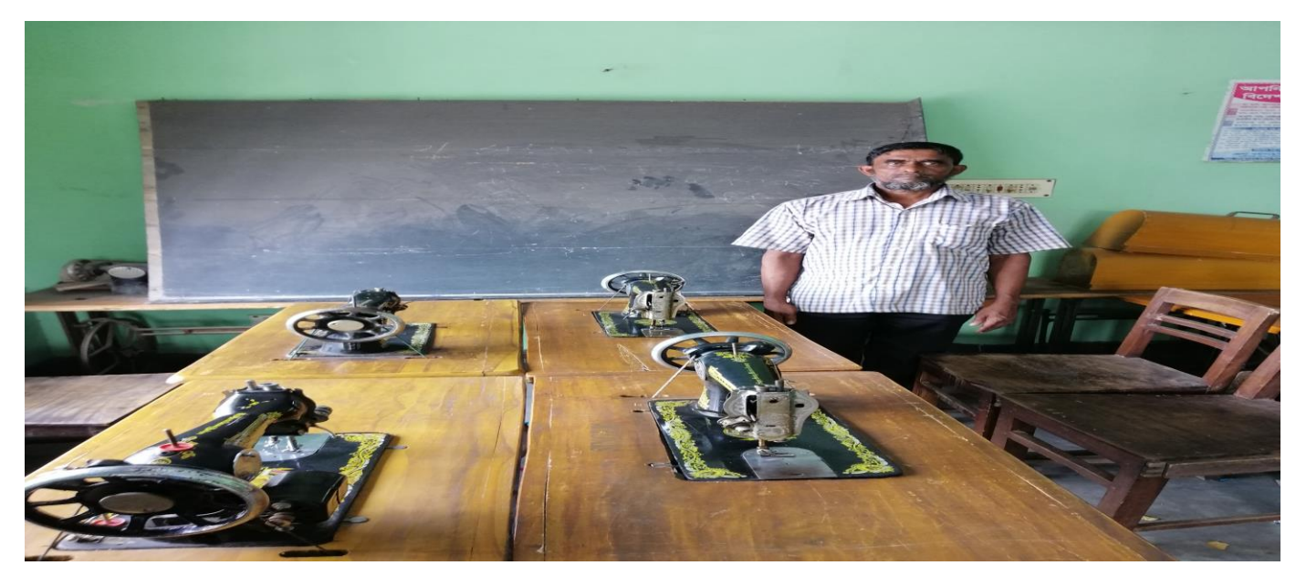
Fig 24 – Department of youth development