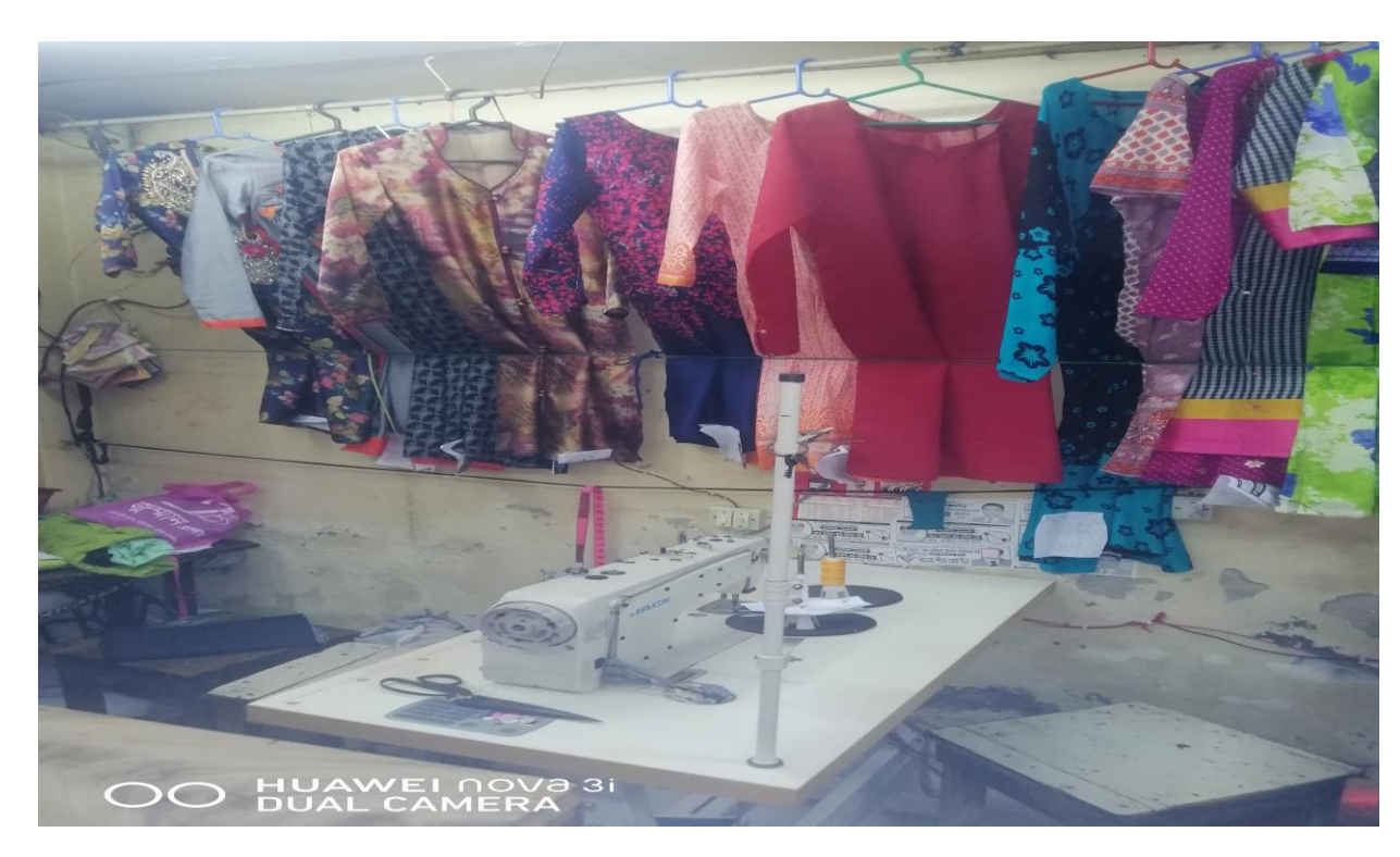
Fig 10:- Barishal sadar LadiesBoutique shops/Tailoring shops