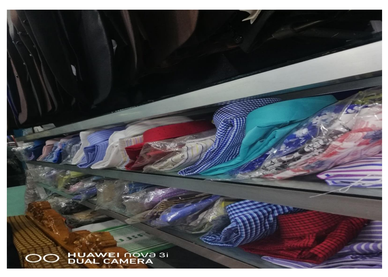
Fig 8: Barishal sadar GentsBoutique shops/Tailoring shops