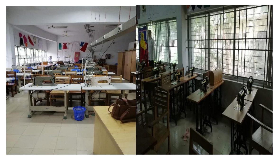
Fig 14:- Barishal sadar LadiesBoutique shops/Tailoring shops