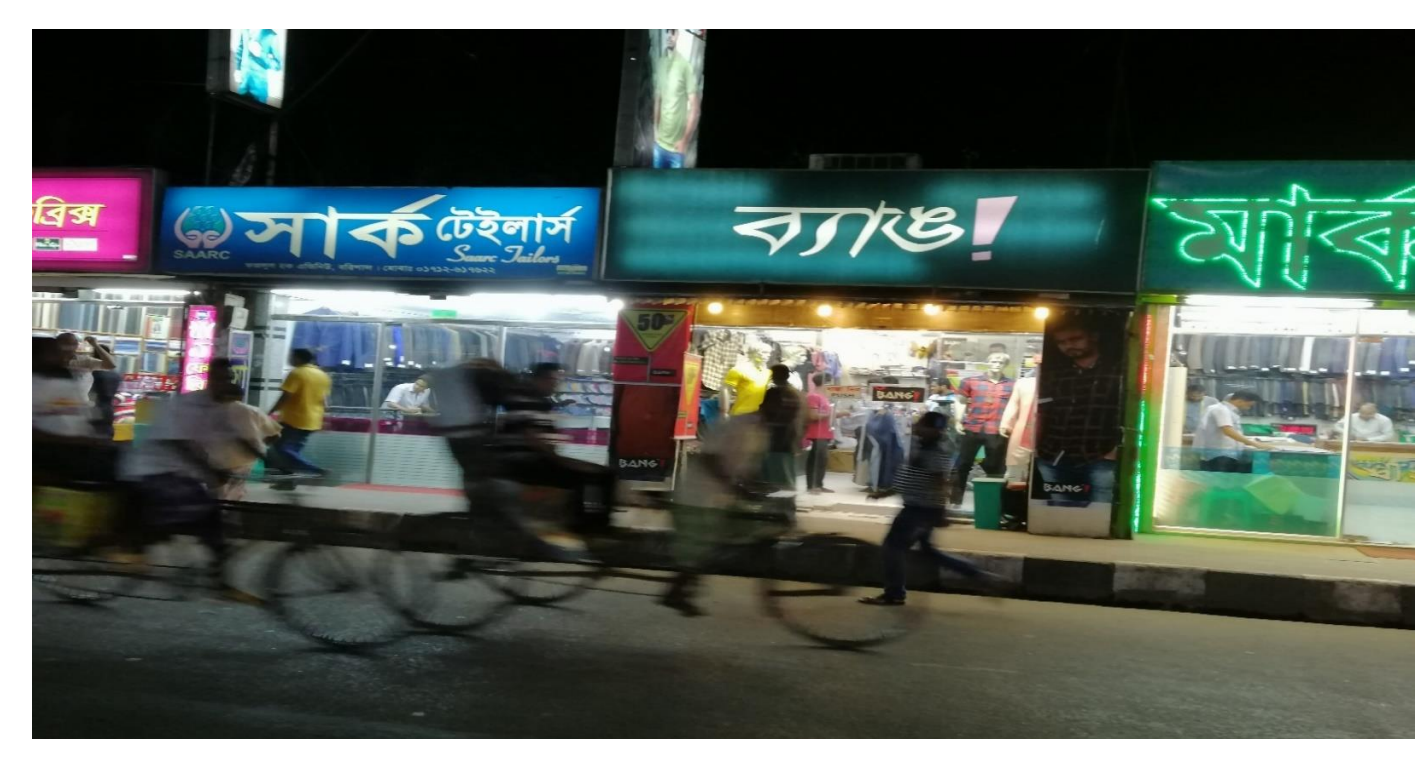
Fig 3: Barishal sadar GentsBoutique shops/Tailoring shops