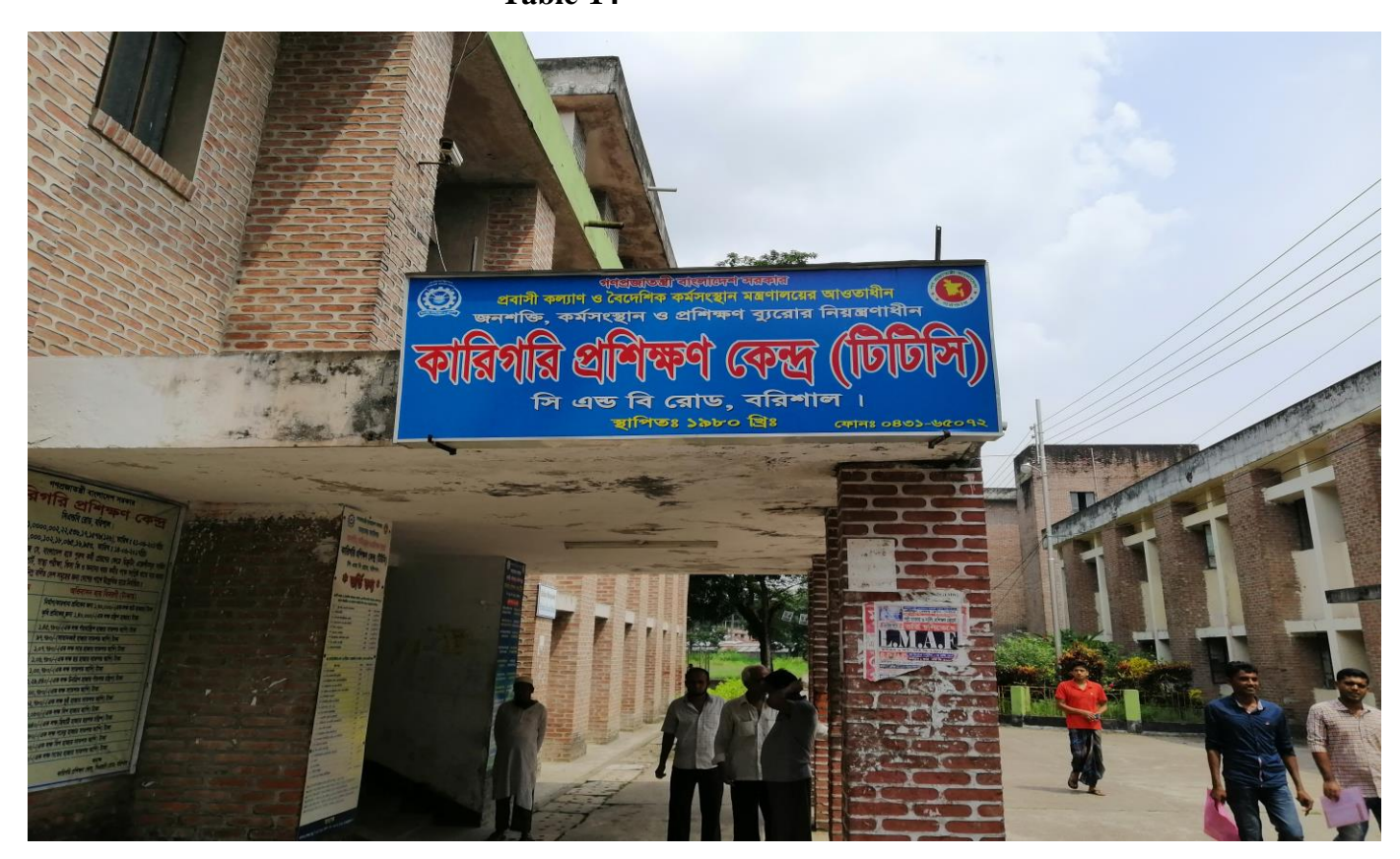
Fig 21 – Technical Training Center