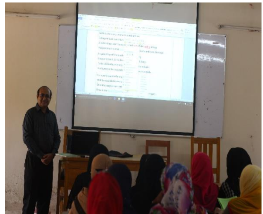
Sir taking class