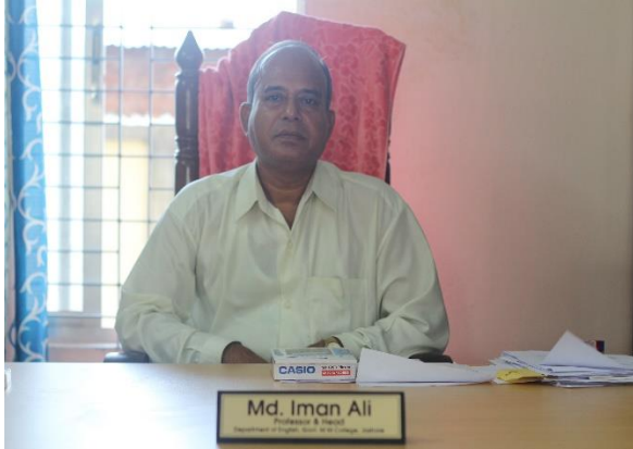
Head of Department of English