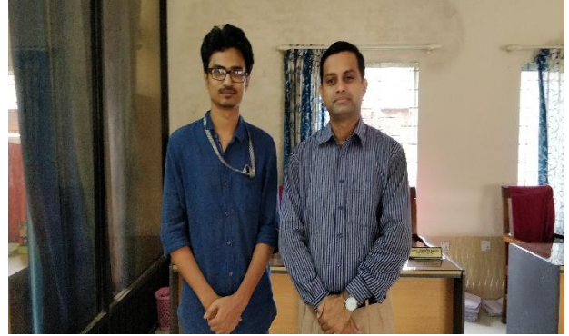
With Bidhan Bhadro Sir