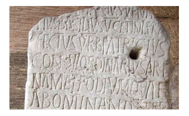
Fig 1:World's First Daily 'Acta Diurna'

Imagine you are reading news not written in paper but in stone. It might sound bizarre at this digital age, however surprisingly this was the scenario of Roman Empire in around 130 BCE. It was for the very first time in the history when people received news curved into stone. Latin Acta Diurna was the name of the first news daily, usually reported the daily events like births, deaths, marriages and the results of legal trials.