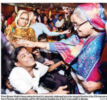
Prime Minister Sheikh Hasina putting the hand of a physically challenged boy at the inaugural function of the 20th International Day of Persons with Disabilities and the 20th National Disabled Day at BCC, at the capital on Monday.

Successive blasts taking toll on human life. HC show cause govt for prevention of deaths Minister Shohid Hossain in Chage Jhalda Medical College of Khulna. Police Station and the fire broke out at the station. In the morning, the fire broke out at the station. In the morning, the fire broke out at the station. In the morning, the fire broke out at the station.