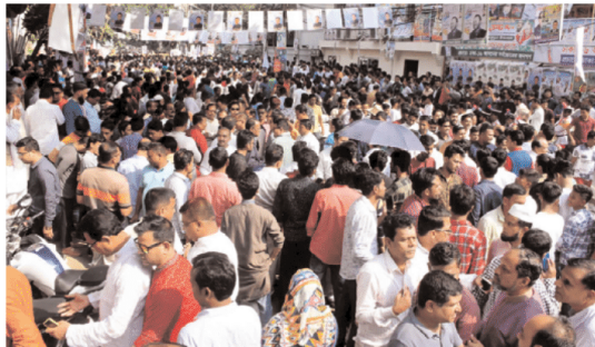
Potential candidates through the Awami League office on Friday to buy nomination papers for the forthcoming 11th parliamentary election at AL President's Dhamondi political office.

Three of the injured succumbed to their injuries at the KMCH in the early hours of Friday, said the police officer. He said they seized the bus after the accident but its driver and his helper managed to flee. —UNB