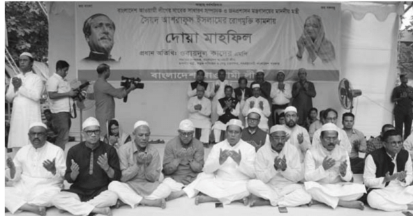
Awami League (AL) holds a doa and milad mahfil seeking early recovery of its President Member and also Public Administration Minister Syed Ashraf Islam on Friday afternoon at its central office at Bangladesh University in the capital.