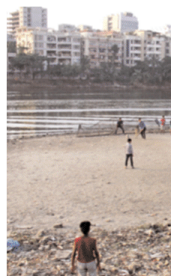
Due to lack of children's playgrounds in Dhaka children are very often found playing on the bank of the Gulshan Lake taking the risk of drowning.