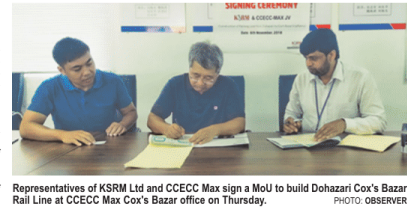
Representatives of KSRM Ltd and CCECC Max sign a MoU to build Dhazari Cox's Bazar Rail Line at CCECC Max Cox's Bazar office on Thursday.

DINAJPUR, Nov 15: Law enforcers, in special drives arrested 22 persons including seven drug traders and two activists of BNP from different areas of the district in last 12-hour ending at 8am this morning.