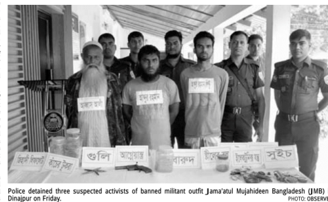
Police detained three suspected activists of banned militant outfit Jama'atul Mujahideen Bangladesh (JMB) in Dinapur on Friday.