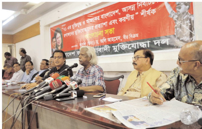
Bangladesh Jatiyatabadi Muktijoddha Dal holds a discussion on at the National Press Club ahead of the 11th parliament election on Sunday.

Temperature: Highest: 30.6°C in Bogura, Lowest: 12.9°C in Tetulia.