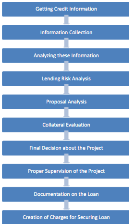
Graph 6: Credit Disbursement Process

conditions and approval by the relevant authorities in the financial institution.