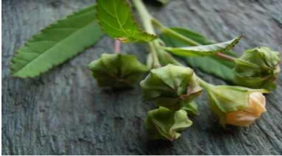
Fig 1.3: Sida rhombifolia L. buds