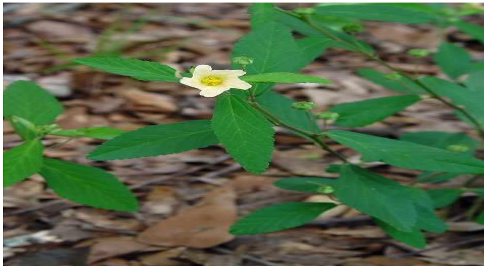
Fig 1.2: Sida rhombifolia L. plant