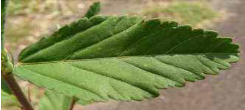
Fig 1.1: Sida rhombifolia L. leaf

tropical, hotter mild and semi-dry situations.