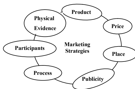
Figure 2: 7Ps of Marketing Strategies of Libraries

Marketing approach is very useful to university libraries to improve their image and to attract more users. No, doubt, marketing helps the librarians to upgrade their reputation within their organizations and as a profession within the society.