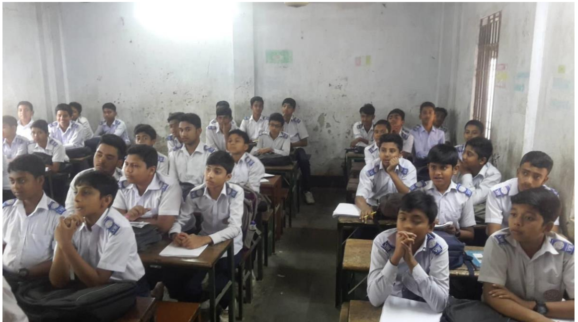
Figure 3 : Students are listening the lecture.