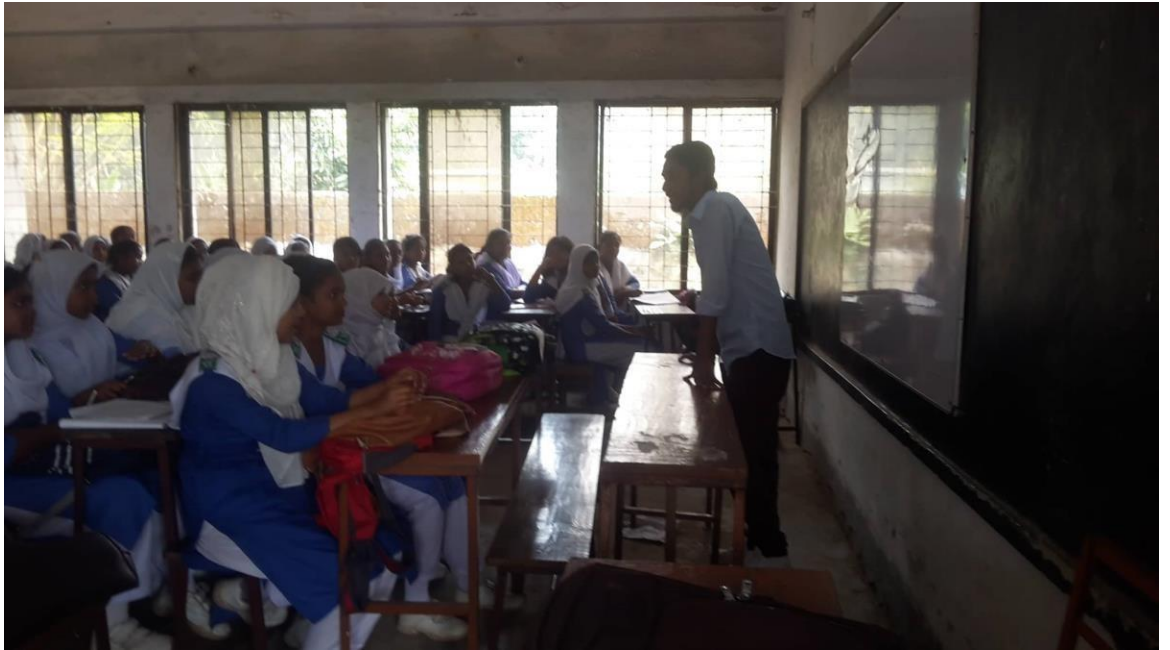
Figure 6 : The intern is teaching the students.