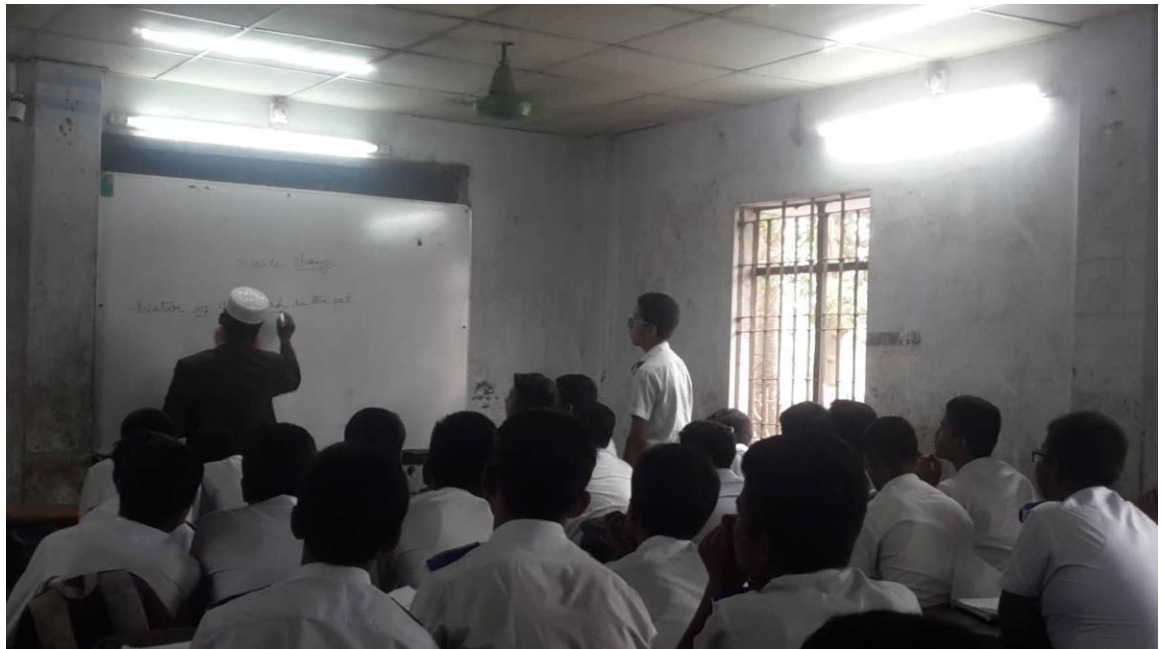
Figure 5 : Teacher is solving the problem by using example