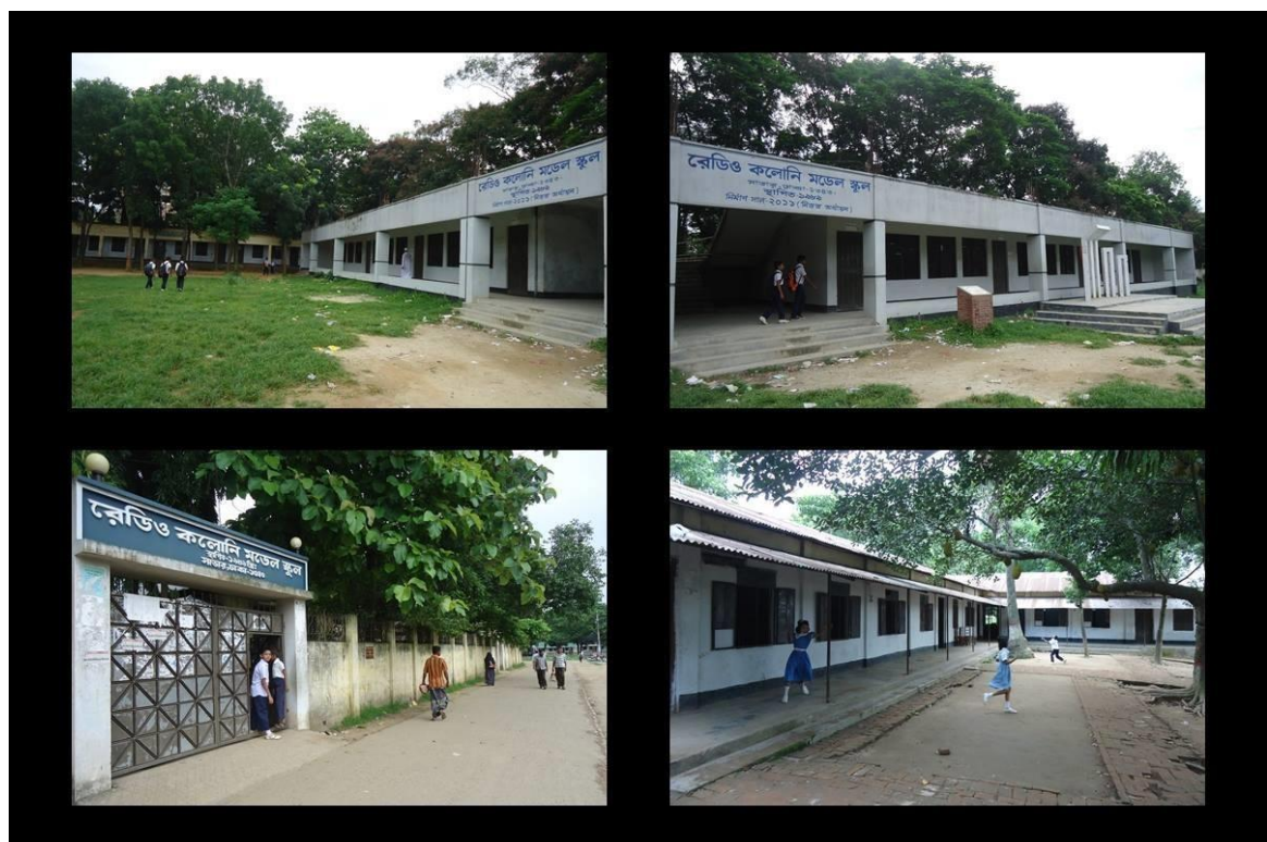
Figure 1 : Radio Colony Model School Compound.