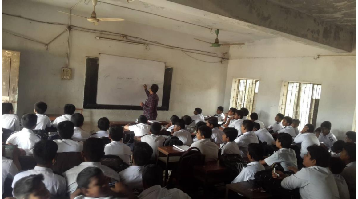
Figure 4 : Teacher is giving the example on the board.