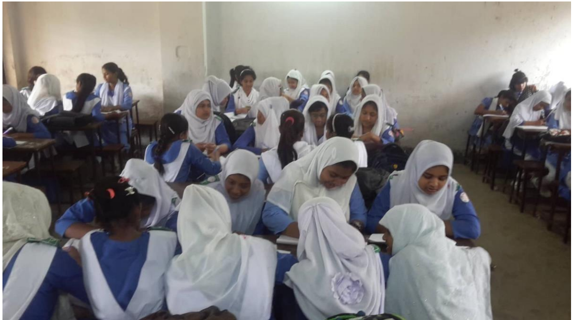
Figure 7 : Group Work