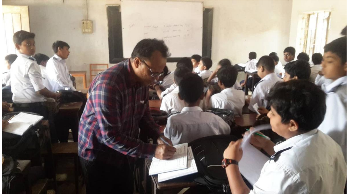
Figure 2 : Teacher is writing students diary.