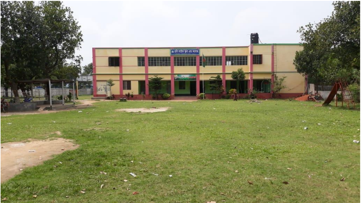
The school ground