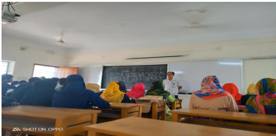
Class Observation -3