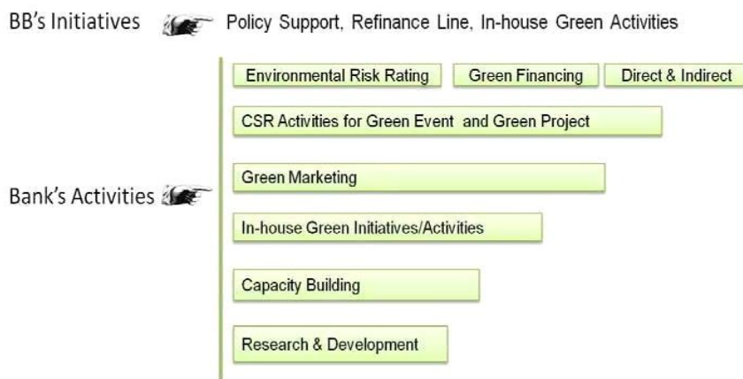
Figure: Green banking activities.