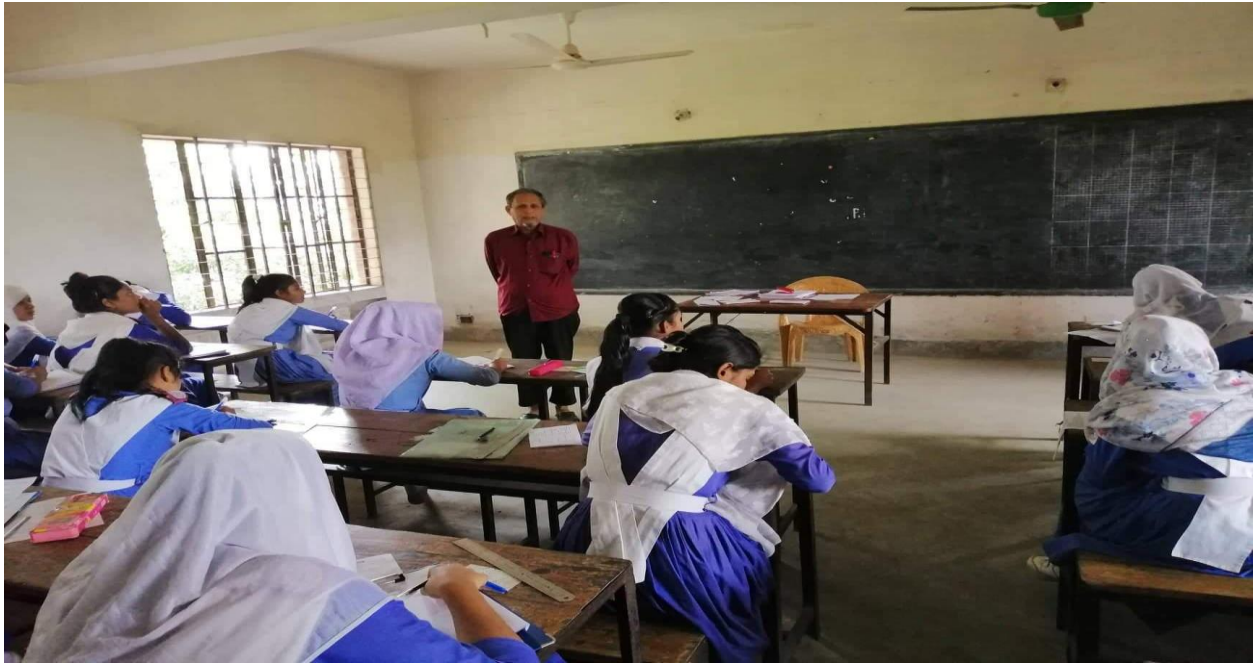
Pic 4: Teacher was telling some effective rules to the students and they were writing down on their notebook.