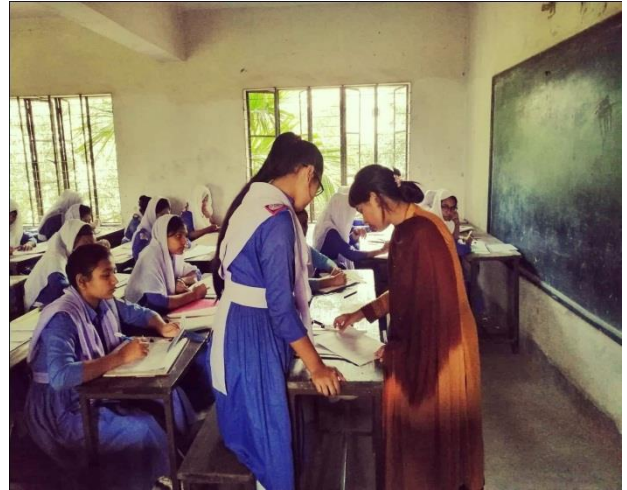
Pic 2: I was checking their class