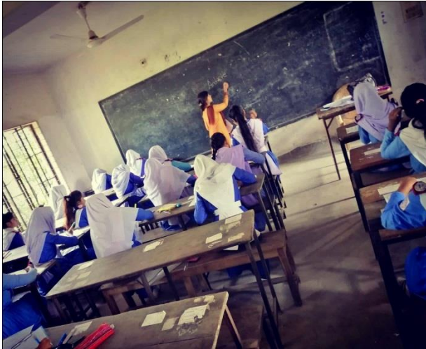
Pic 1: I started my class with a grammatical activities. Topic based on Article.