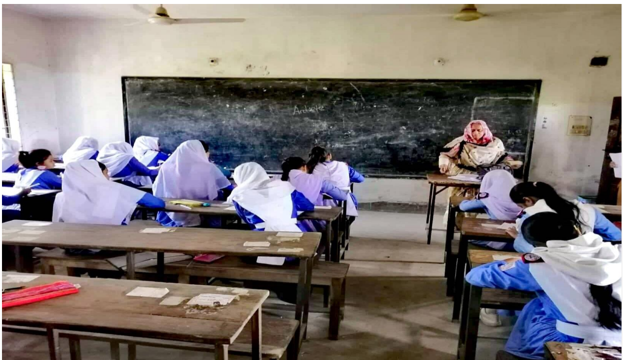
Pic 5: Teacher was teaching the students a story from textbook.