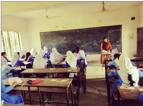
Pic 3: Students were concentrate listening to my lecture