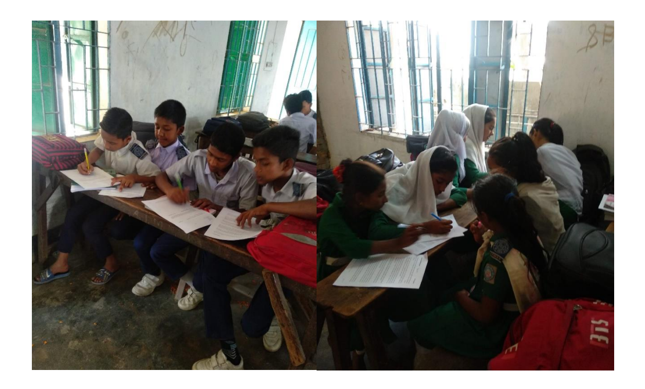
Figure 04: Group Activity