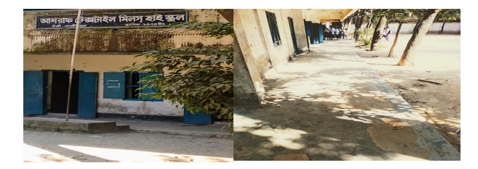
Figure 1: Ashraf Textile Mills High School