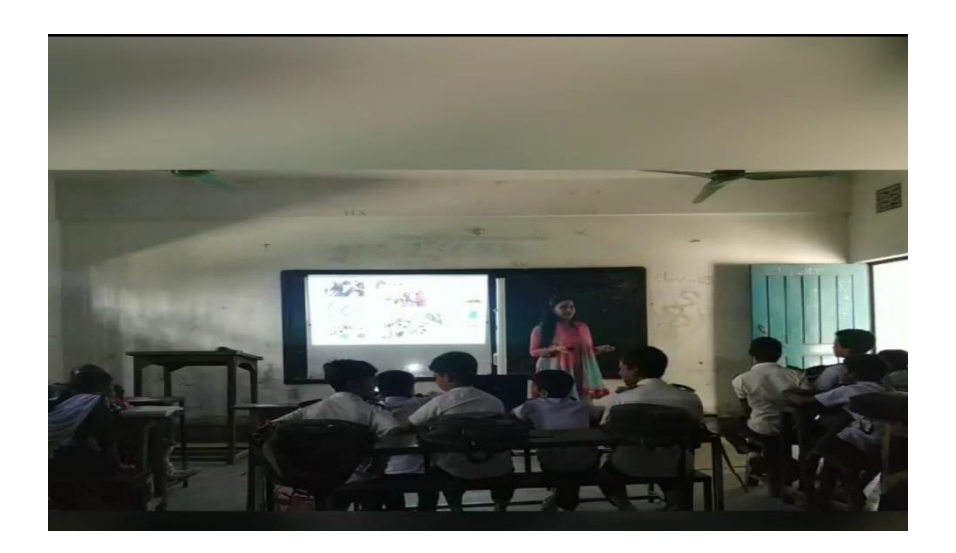
Figure 03: Class Observation