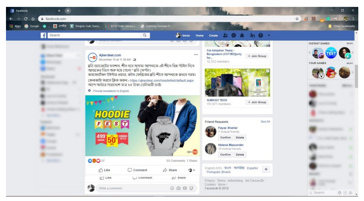
Figure 3: Social media advertisement.

Ajkerdeal.com has targeted only the people inside the geographic area of Bangladesh as they only do the business in Bangladesh. There are products for both male and female, for people of all ages so targeting based on sex and age is not applicable in this case.