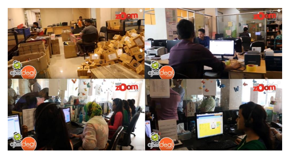
Figure 13: The infrastructure of Ajkerdeal.com Ltd.