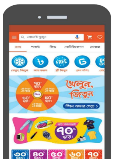
Figure 6: Ajkerdeal.com mobile app.

Considering the increased use of smartphones, Ajkerdeal.com has made the shopping more easy by introducing Ajkerdeal.com mobile app. This app is free and available on Google Playstore and Apple Store. This app is a substitution for the website and it is much more organized and easy to use. Currently, there are more than 500,000 users of this application.