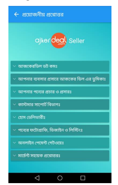
Figure 9: Ajkerdeal.com mobile app for sellers.

3.4.2. Promotion to the Consumers: The business of Ajkerdeal.com is totally based on digital media, specifically online. Ajkerdeal.com has major six tools to promote the brand and the