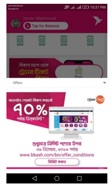
Figure 4: bKash app offer.

App s/he can enjoy up to 70% discount. Considering this, Ajkerdeal.com is ahead of its competitors.