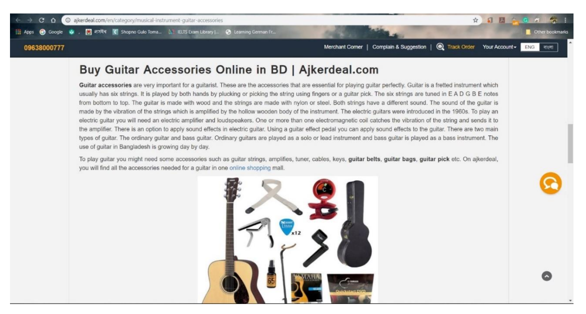
Figure 10: SEO content

By doing this, the keywords are highlighted and when clicked on the keywords it will take the customer to the relevant web page.