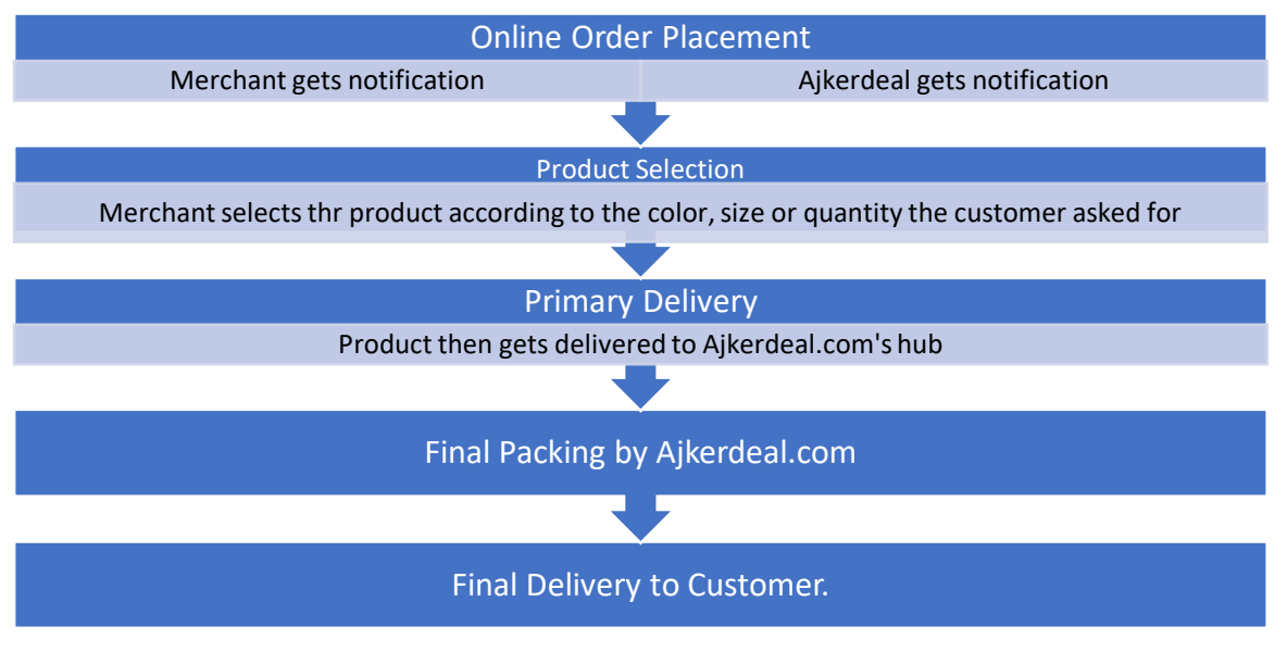
Figure 12: Process flowchart.

Ajkerdeal.com the process starts when the customer starts browsing the website of Ajkerdeal.com. In order to make the service easier, the company has built a user-friendly website and a mobile application. The order placing process is also simple. After a customer has placed an order, the collector of the company makes sure that the product that is provided by the seller has no defects. Then the collector brings the product to the nearest hub and the fulfillment department makes sure that the product is well packed and most importantly it is done within the time. Finally, the delivery person delivers the product to the front door of the customer. The estimated time of this whole process is three to four business days. And it is mentioned in the confirmation notification that the customer gets right after the order placement.