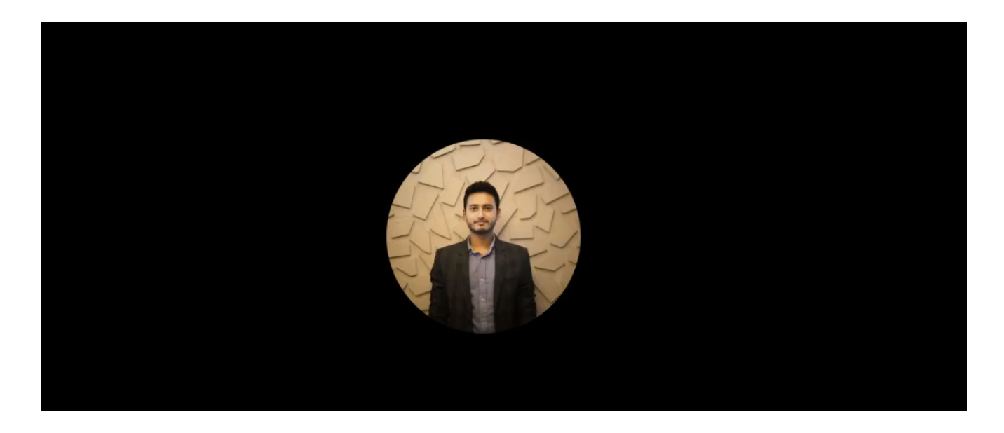
Figure 1: Picture 1

I have taken the screen shot when I have responded the class.