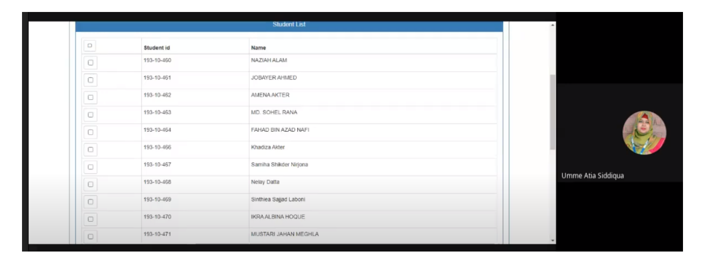
Figure 3: Attendance