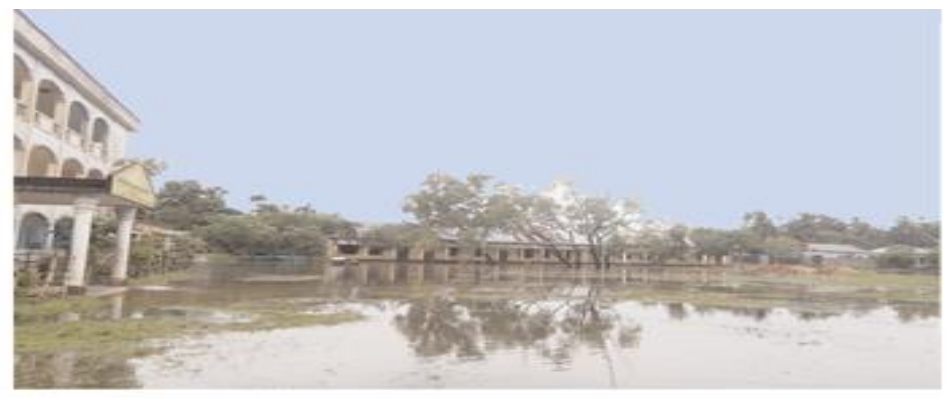
Students of Jhenaigati Government Model Pilot High School suffering because of water logging on their school scored in Jhenaigati Government Model Pilot High School suffering because of water logging on their school scound in Jhenaigati of Shermur. The roboto was taken on Mondel in Jhenaigati of Shermur.