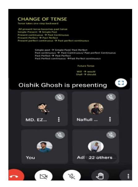
Figure 2: Observation of Class No. 2