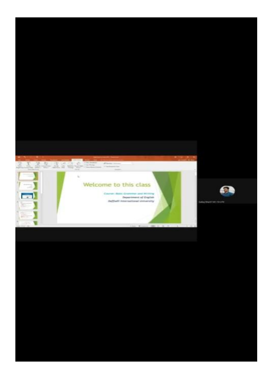
Figure 3: Conducting Class