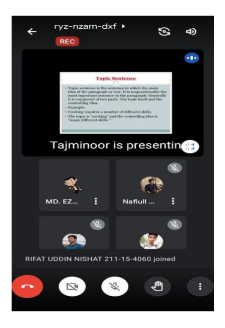
Figure 1: Observation of Class No. 1