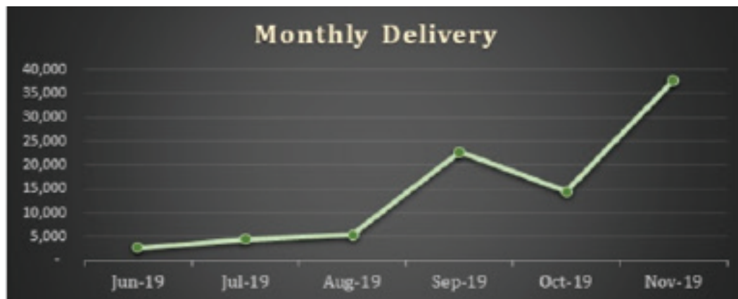
Figure 2: Monthly Delivery

Based on this graph, in every month orders have increased by 10% from June to August approximately (Evaly, 2020). It means demand for high value products such as motorbikes and mobile phones are being increased significantly.