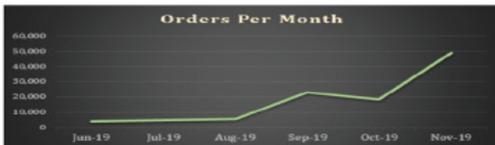
Figure 1: Orders of Evaly

Online marketing with new digital innovation is nowadays an impressive trend of marketing that attracts a great number of customers. As opined by Kharat, Tibe, and Chitnis (2020), integrated communication with developed features is possible through an online marketing process. In Bangladesh, Evaly became an exceptional online superstore from which all kinds of groceries and home products are delivered to customers. Through using a single website, consumers of this market also get their products available such as groceries, books, copies and pencils, dresses, mobile phones, home appliances, etc. (Evaly, 2020). Product range of Evaly has individual security that has brought 230 million sales in product within July, 2019 (Express, 2019). Orders from this online supermarket and rate of monthly delivery have been described in the following graph.