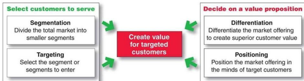
Figure: Creating value for targeted customers

Marketing strategies are the main goal of an organization, marketing strategies are the aim of creating value to the consumers and which developed customer relationship. Marketers have an important role to play in building a marketing strategy. Segmentation, targeting, positioning and differentiation are the core principle in marketing strategies. A business has different types of consumer, product and need at first segmentation of the market. A marketer should be conscious of which segment offers the best chance. A segment can be described as a geographical, psychological, behavioral component in different ways. A business can join one or more segments when a marketer identifies a segment that comes from the target market portion. After the firm established what section they chose to come up with the differentiation determines how its product proposition for each targeted segment can be distinguished and what place it wants to hold in that segment. Positioning arranges a brand in the minds of the target consumers to hold a simple, identifiable and attractive position relative to competing products.