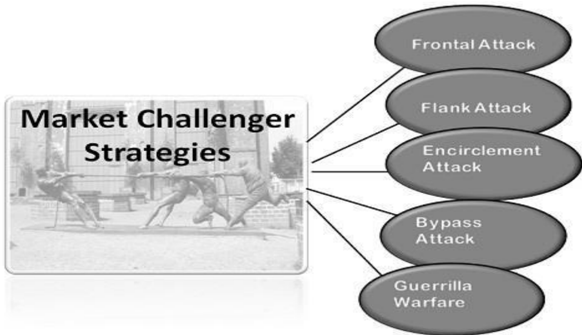
Figure: Market challenger strategy