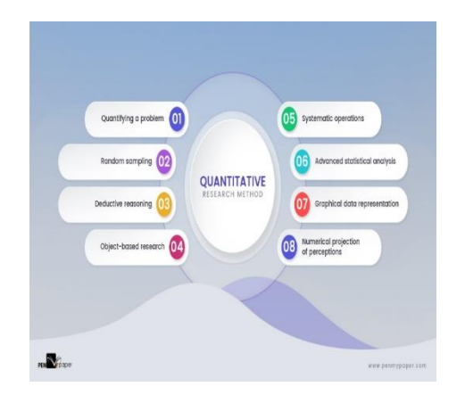
Figure: 4.8: Quantative Research method