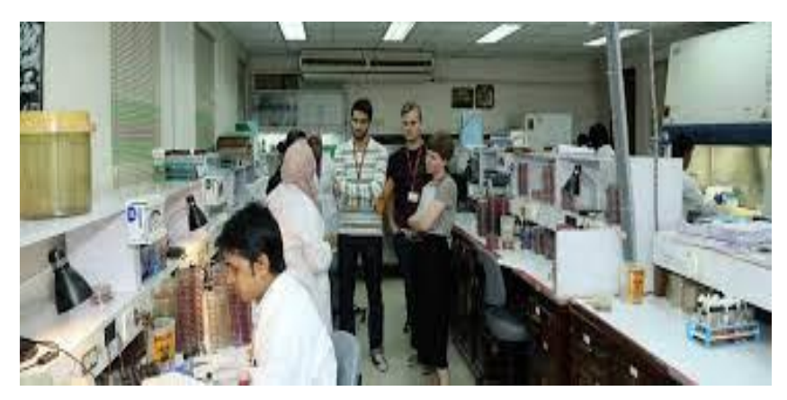
Figure 4.2: Teacher discussing with the students