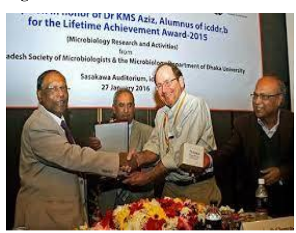
Figure 1.3: Prize ceremony