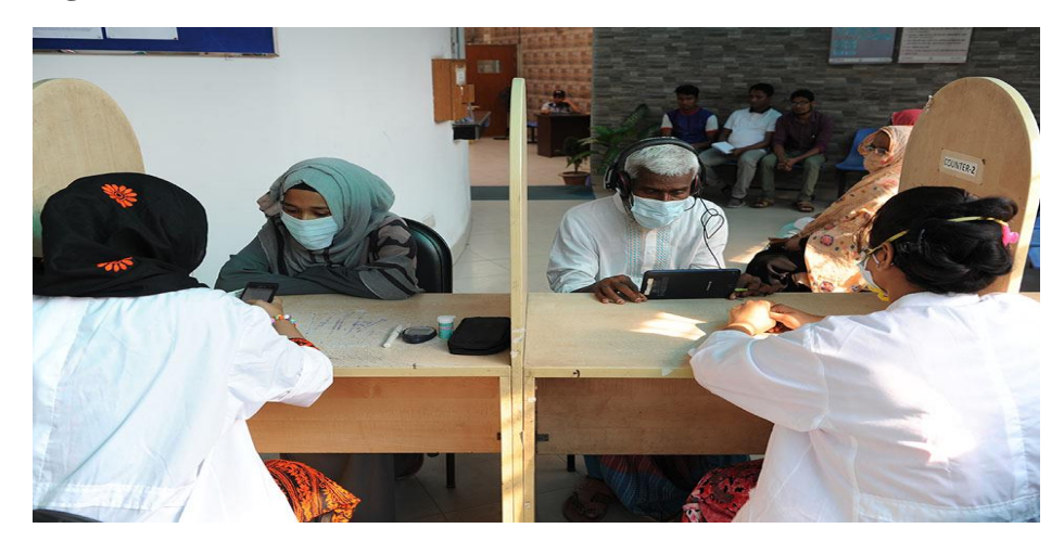
Figure: 1.4: Field work

In Dhaka, we also have two urban field sites: Kamalapur and Mirpur. These sites have been used to collect crucial data on urban poor health and to test treatments to increase access to health care. As the number of Bangladeshi individuals living in cities grows, it is critical to understand urban health. The economics and pathology of different infectious diseases, as well as vaccination research and other community-based therapies, have all been studied. With a population of 140,000 people, Kamalapur is a heavily populated area of informal settlements. Pneumonia, shigellosis, influenza, and dengue fever have all been studied on the site. It has also served as the foundation for research into urban health systems, including how to best offer health care, set up referral systems, and fund health-care initiatives.