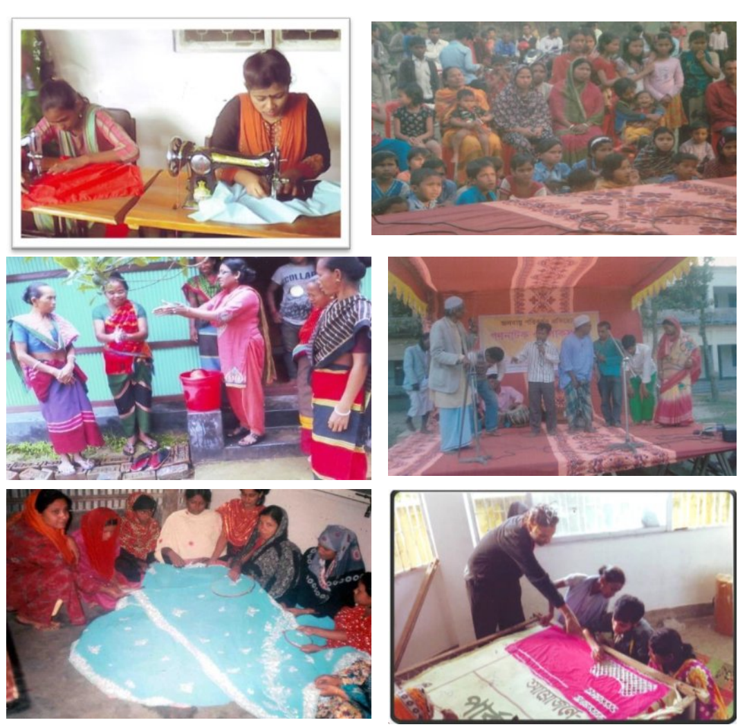
Analysis of the Findings: