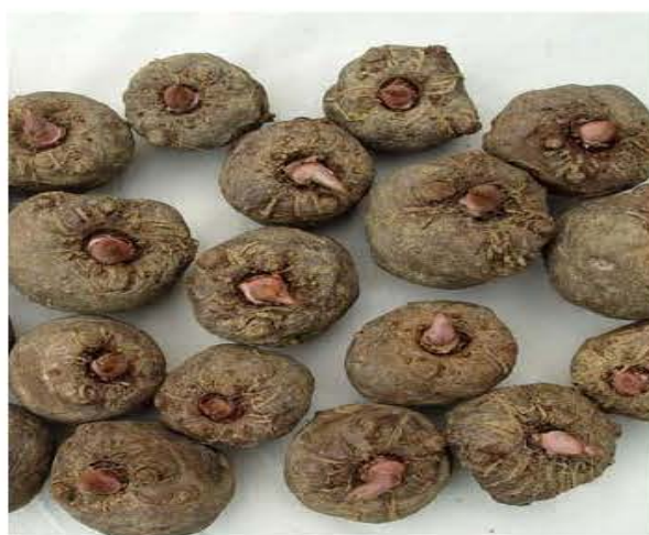
Figure 2. Konjac root

The purpose of this work was to determine fiber, moisture and ash contents etc. in konjac flour which may be useful for further extensive analyses.