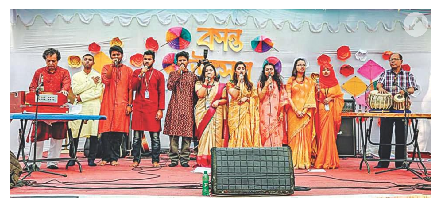
ULAB Shangskriti Shangshad Club

The club is working diligently on inspiring women to contribute by arranging womencentred workshops, competitions and all-women teams. But alongside these challenges, there remains undying support from the university which never failed to provide financial assistance to the best of its ability. They hope this support will one day pay off and help the robotics community gain more coverage.