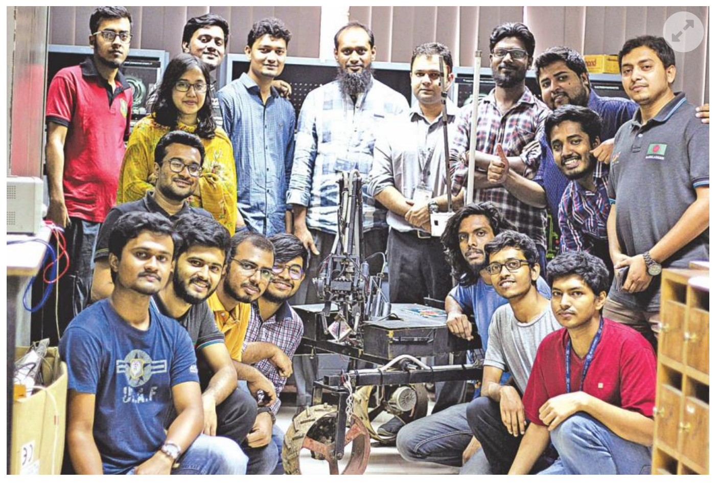
BRAC University Robotics Club

department-based club, is coordinating all the members of the club to attend meetings and discussions, in the middle of working on their own ventures. On the other hand, the chairman, a self-made entrepreneur himself, who's also the club's advisor, provides an admirable amount of support, along with the strong alumni community and the university's PR team who provide campus radio announcements of the club's events.