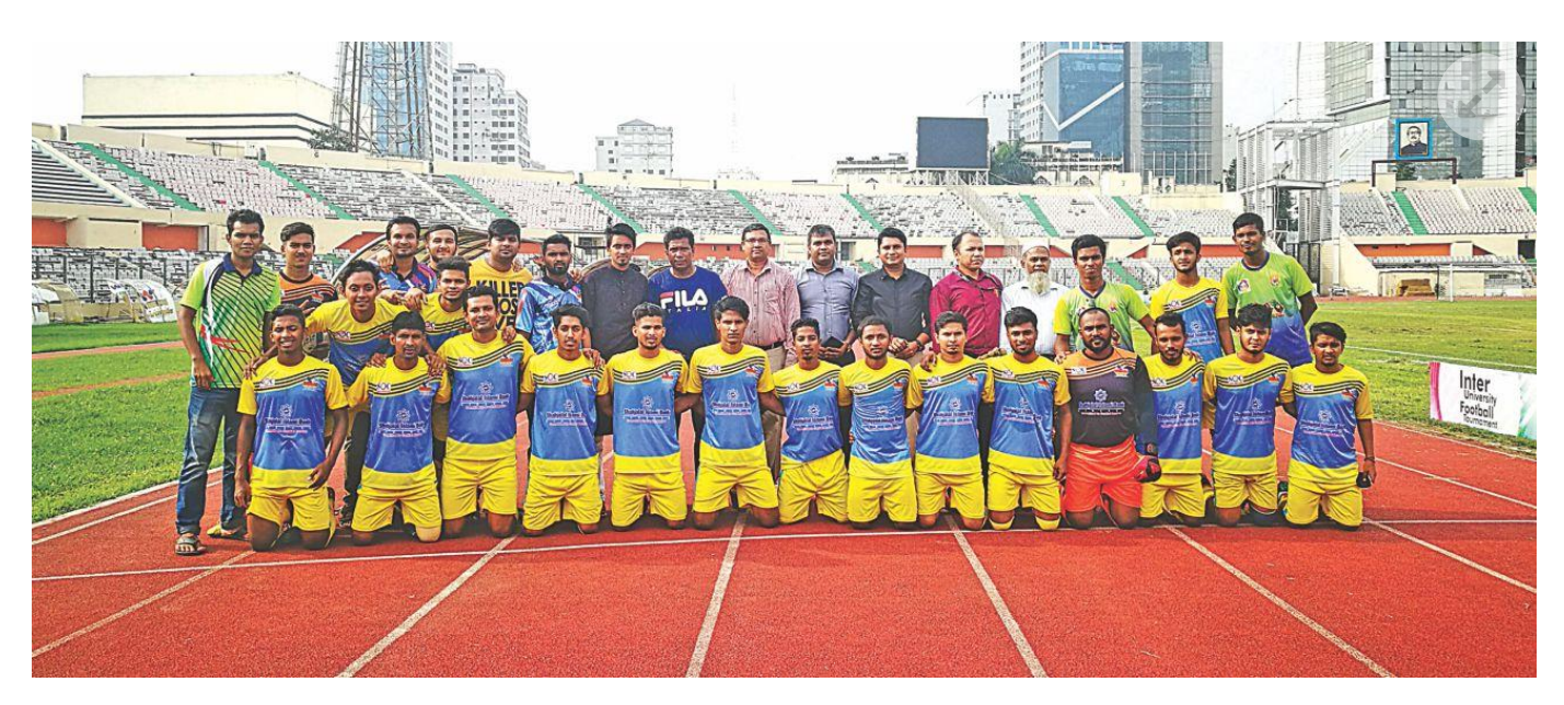
Southeast University Games and Sports Club

For most university students, their clubs or student bodies are like their families. Student organisations, whether they promote cultural activities, volunteering, sporting events or science, are of utmost importance for the ecosystem of an educational institution. The private universities of our country have a strong network of student clubs which bring students closer to the practical side of things, as well as theoretical. Though these clubs have accomplished a lot in terms of skill-building and networking, there remain many challenges that sometimes hinder these endeavours. In conversation with some of the most prominent university clubs in the country, we find out what drives them, what they intend to achieve, and what challenges they face along the way.