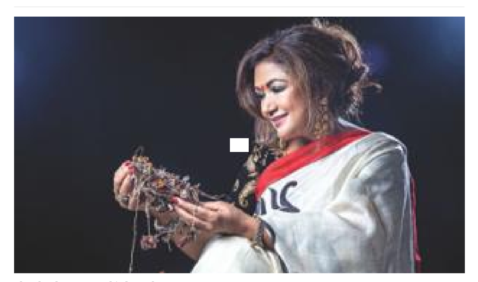
The Flamboyant Songbird Speaks