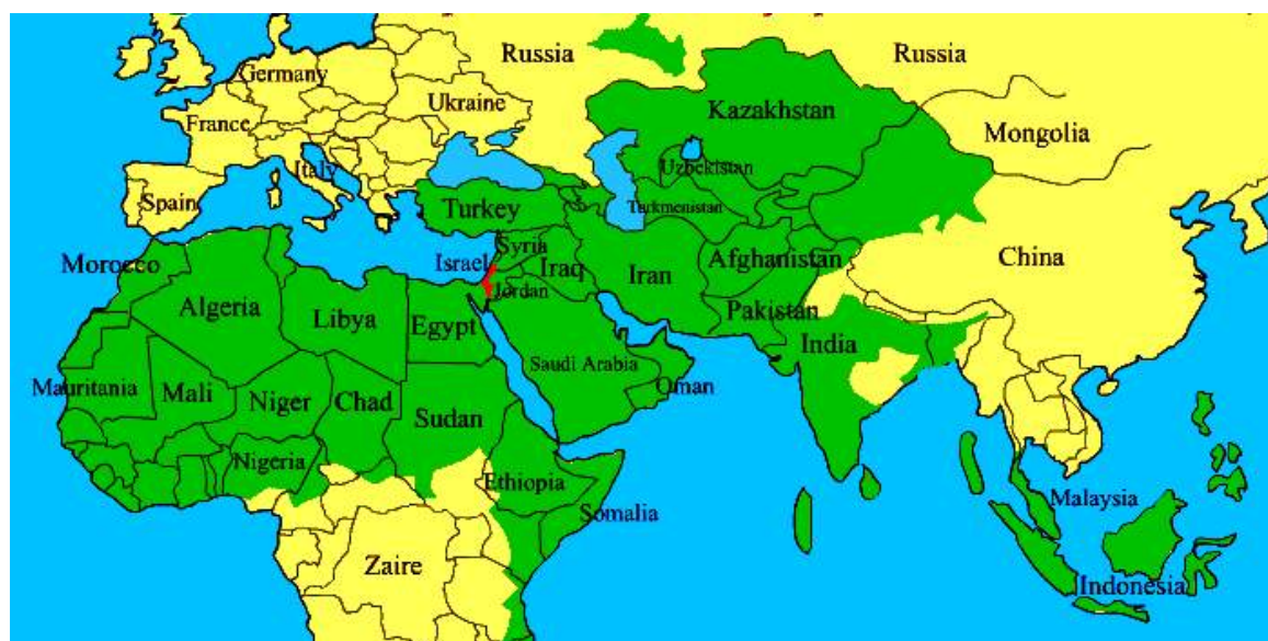
Fig: Map of Muslim Countries.

If we capable to cultivate every brain of Muslim ummah surely we will be able to revive our past day of “Science and knowledge”.