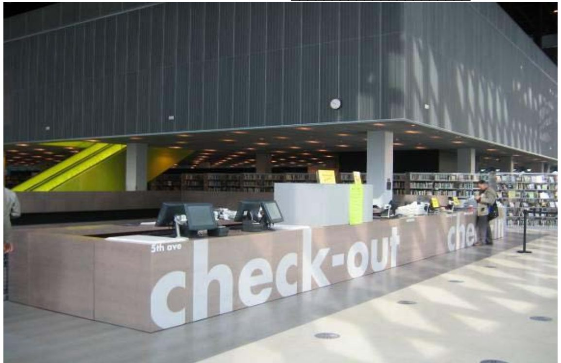
Fig: Seattle public library